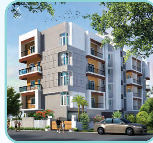
T.Nagar : STONERIDGE Address: Old No:14, New No:22, Crescent Park Street, T.Nagar, Chennai-600017 8 Apartments : Stilt+4 floors ; 3BHK+study : 2223 sft ; 3BHK : 1648 sft