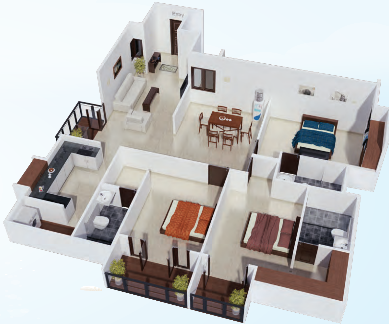
Flat C 1902 sq.ft.