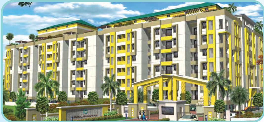
Velachery Phase 1 ABHINANDAN Address: Seshadripuam First Main Raod , Baby Nagar, Velachery, Chennai-600042 140 Apartments; Stilt+ 7 floors ; 2BHK+study (1207 sft- 1320 sft) ; 3BHK (1443 sft-1569 sft)