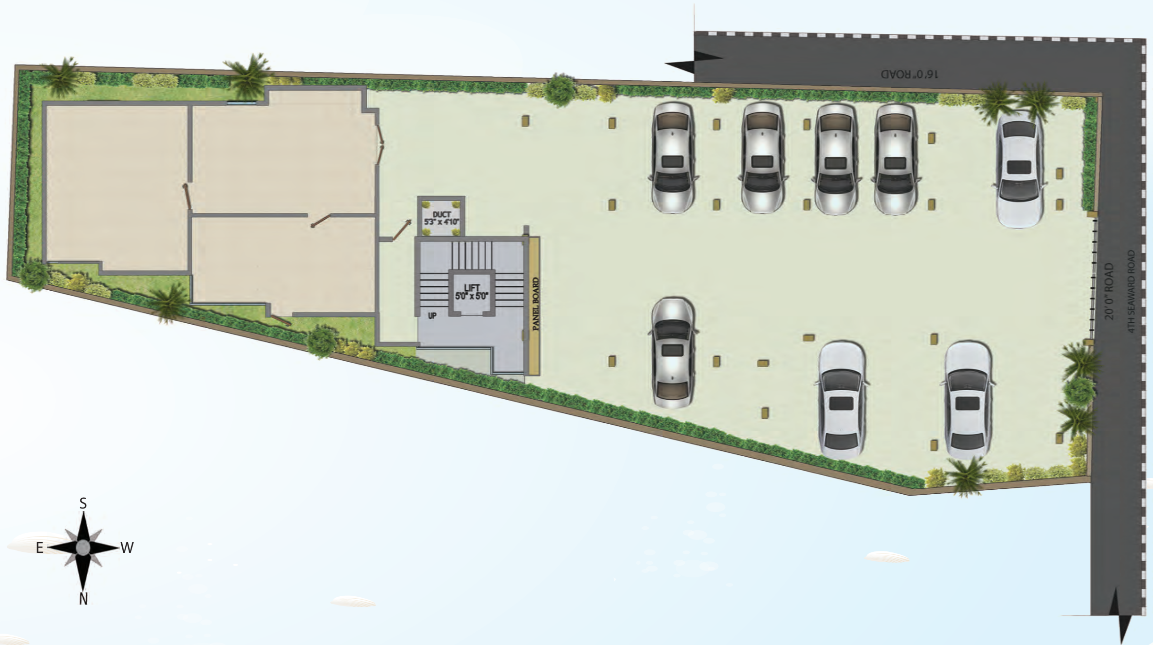
Site & Stilt Floor Plan