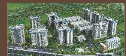
Splendor Grande, Sector 19, Panipat