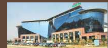
Splendor Forum, Jasola, Delhi