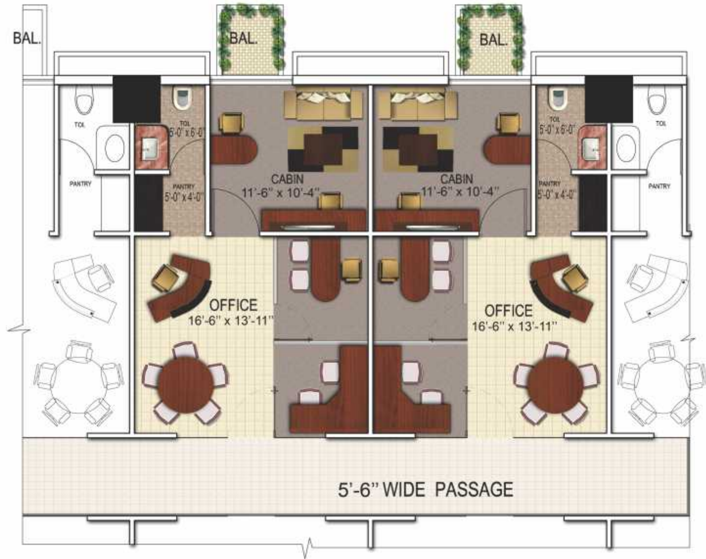
Typical Office Suite