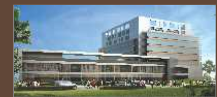
Splendor Trade Tower, Sector 65, Gurgaon