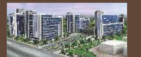
Splendor Spectrum one, Sector 58, Gurgaon