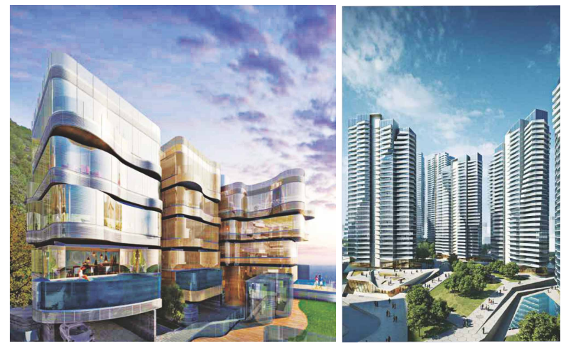
Projects designed by Aedas, Singapore