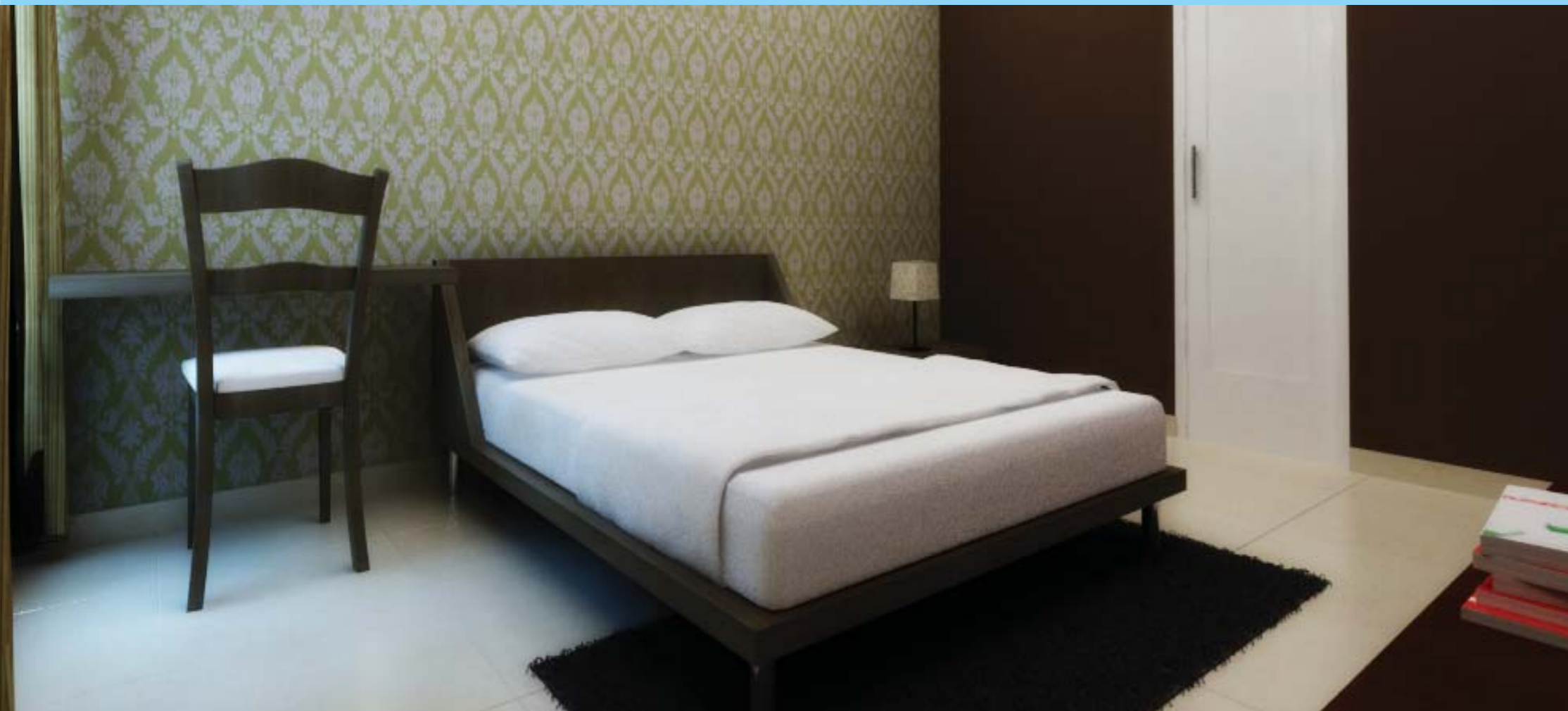
Rendered image of bedroom

A space to recharge and one to expend energy.