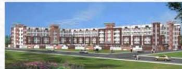
Sowparnika Beetel Coimbatore