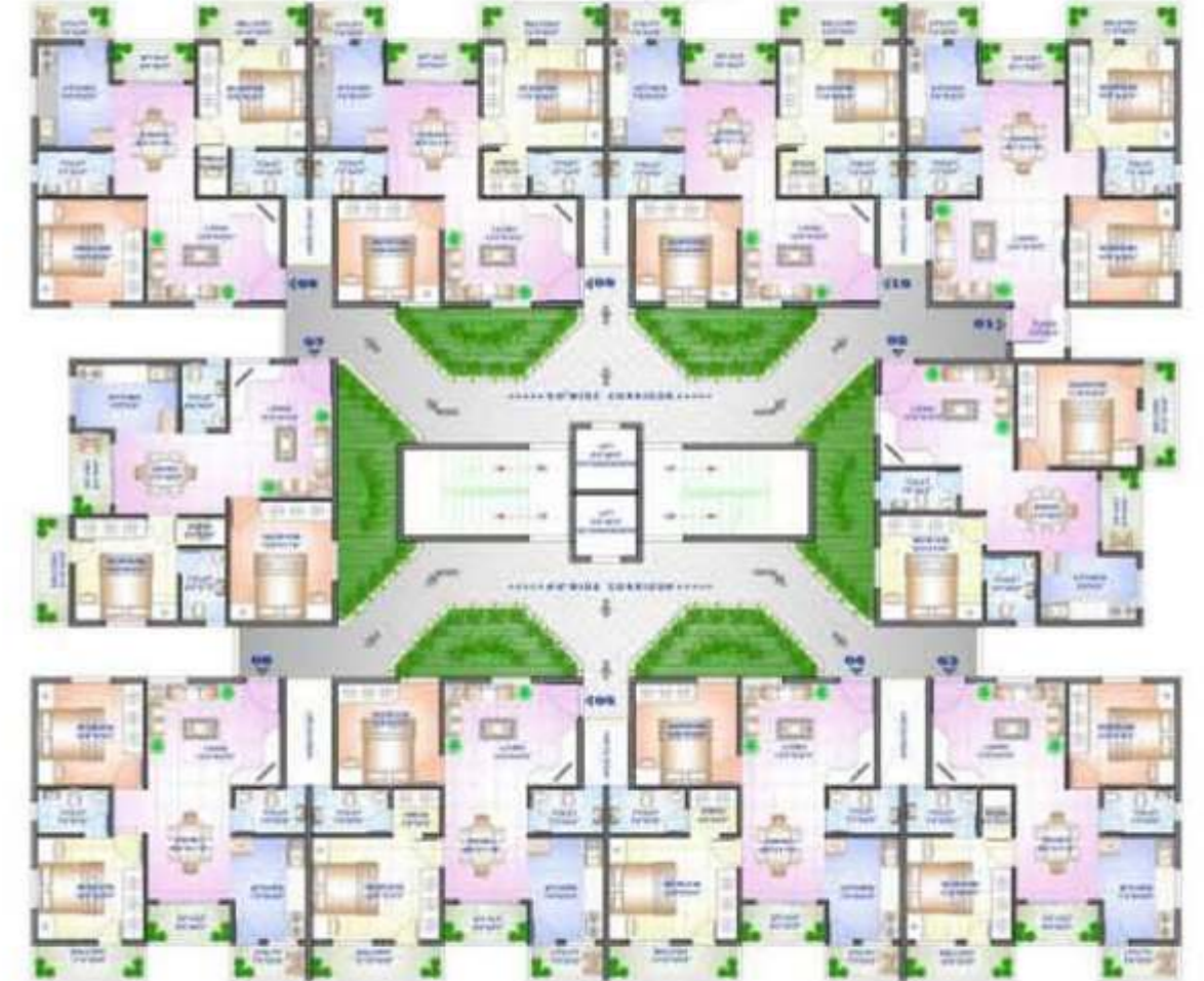
TYPICAL FLOOR PLAN 2 BHK UNITS: 10units per floor 2BHK units - 929sft to 1023sft

“ That's Ritika and most times you will find her at the kid's play area near Mabella ”