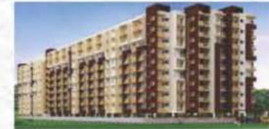
Sowparnika Purple Rose Bangalore