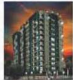
Sowparnika Highlands Palippuram, Kozhikkuttom.