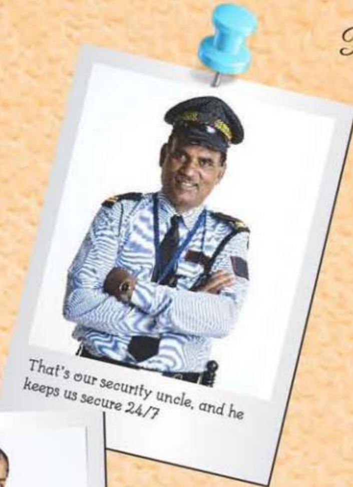
That's our security uncle, and he keeps us secure 24/7