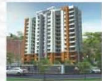
Sowparnika Promenade Near KMS Hospital, Trivandrum.