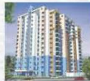
Sowparnika City Crown Between Karamana & Poosippura