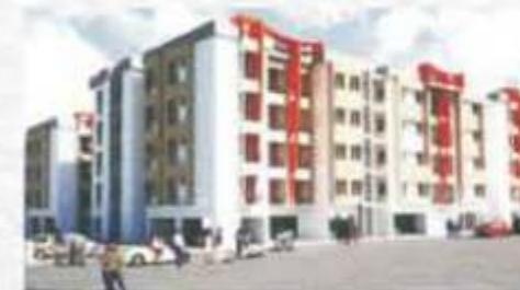
Sowparnika Skandagiri Coimbatore - 69 Flats