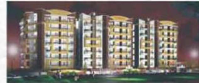
Sowparnika Swastika 1 Bangalore