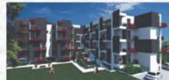
Sowparnika Royal Splendor Mysore