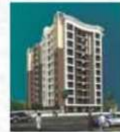
Sowparnika Regal Vizhayilla, Peronkkada.