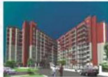
Sowparnika Shirdi Phase II Opp. St. Thomas School, Trivandrum.