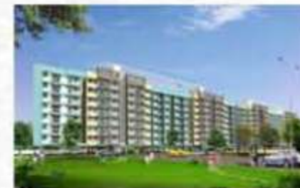
Sowparnika Swastika 2 Bangalore