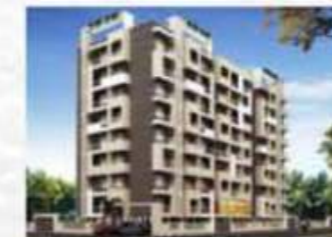
Sowparnika Grandeur Coimbatore