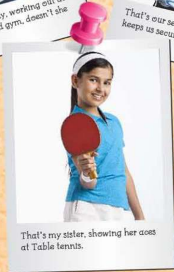
That's my sister, showing her aces at Table tennis.