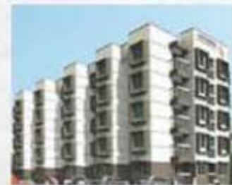
Sowparnika River View Garden Thrikkannapuram, Trivandrum.