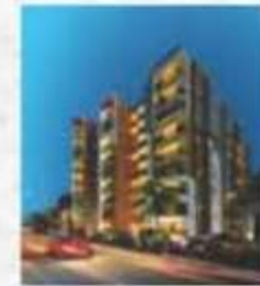
Sowparnika Vaishnavam Sreekanthapuram