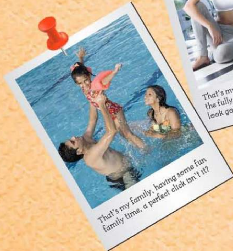
That's my family, having some fun family time, a perfect click isn't it?