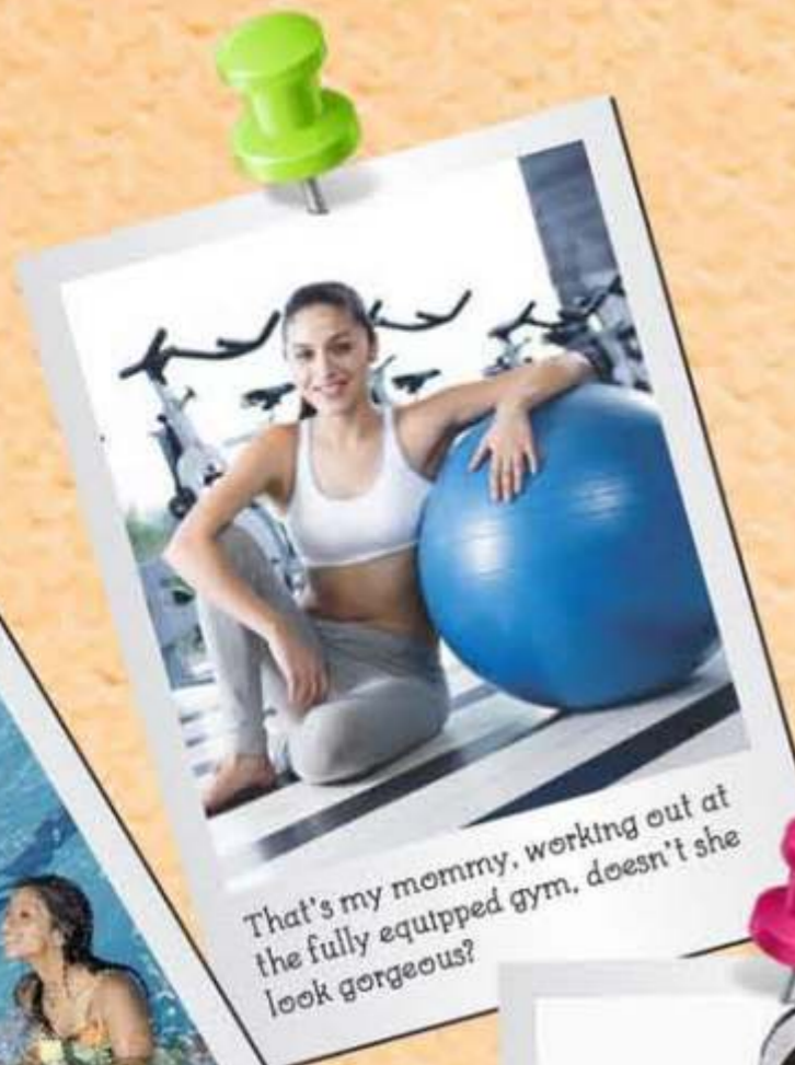
That's my mommy, working out at the fully equipped gym, doesn't she look gorgeous?