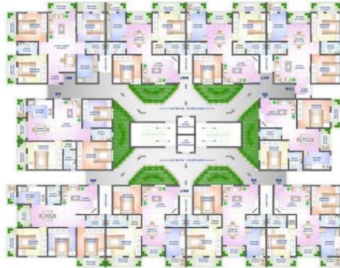
TYPICAL FLOOR PLAN COMBINATION OF 2 & 3BHK UNITS: 10units per floor 2BHK - SBA - 929sft to 1023sft, 3BHK - SBA - 1168sft & 1204sft

“ This is Niki from Begonia and she loves the flower gardens next to her block ”