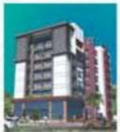
Travancore Heights Changanacherry