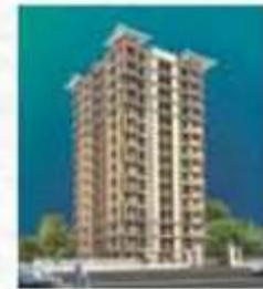
Sandal Tower Kattela, Trivandrum.