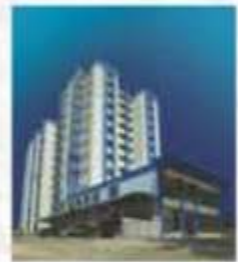
Sowparnika Shirdi Towers Opp. St. Thomas School, Trivandrum.