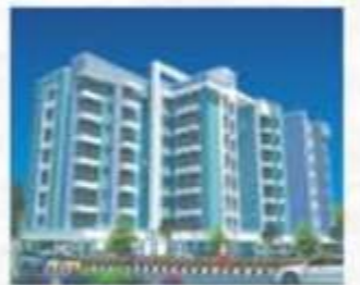
Sowparnika Surya Kiran Pp Nagar - 56 Flats