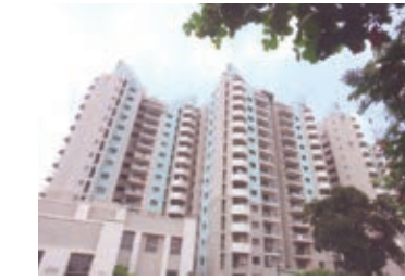
Nagarjuna Maple Height Off Marathahalli - K R Puram Ring Road