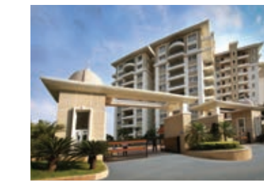
Nagarjuna Residency, Gachibowli