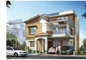
Green Province, Sarjapur