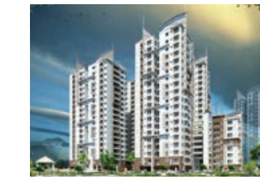
NCC Urban One, Narsingi