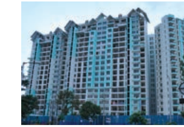
Nagarjuna Aster Park, Yelahanka