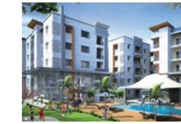
NCC Urban Park Square, Near Swami Theatre