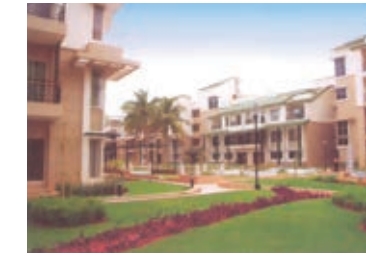
Nagarjuna Green Woods, Off Marathahalli - Sarjapur Ring Road