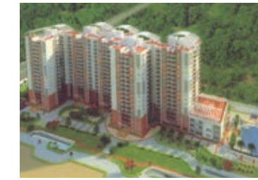
Nagarjuna Meadows Phase II, Yelahanka