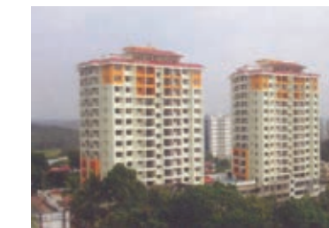
Nagarjuna Green Valley, Kakkanad