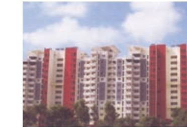
Nagarjuna Meadows Phase I, Yelahanka