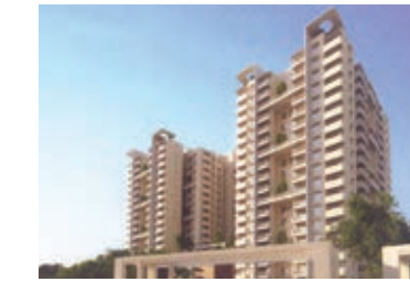
Nagarjuna Ivory Heights, Off Marathahalli - K R Puram Ring Road