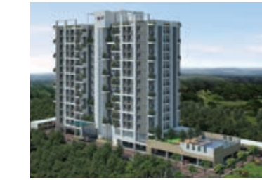
NCC Urban Senate, Kaloor