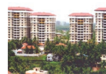
Nagarjuna Pearl Bay, Kadavantara