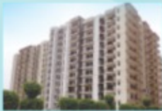
SG Impressions 58 Phase-I & II, Rajnagar Extn., Ghaziabad