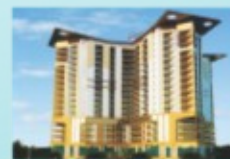
SG Benefit, Govindpuram, (Hapur Road) Ghaziabad