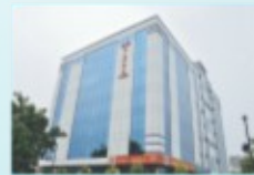
SG Alpha Tower, Sec-9, Vasundhara, Ghaziabad