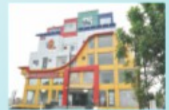
SG Beta Tower, Sec-3, Vasundhara, Ghaziabad