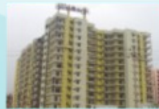
SG Impressions Plus, Rajnagar Extn., Ghaziabad