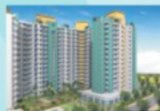
SG Homes, Vasundhara, Ghaziabad