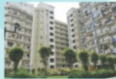
SG Impressions, Vasundhara, Ghaziabad