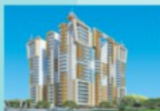
SG Oasis, Sector-2B, Vasundhara, Ghaziabad