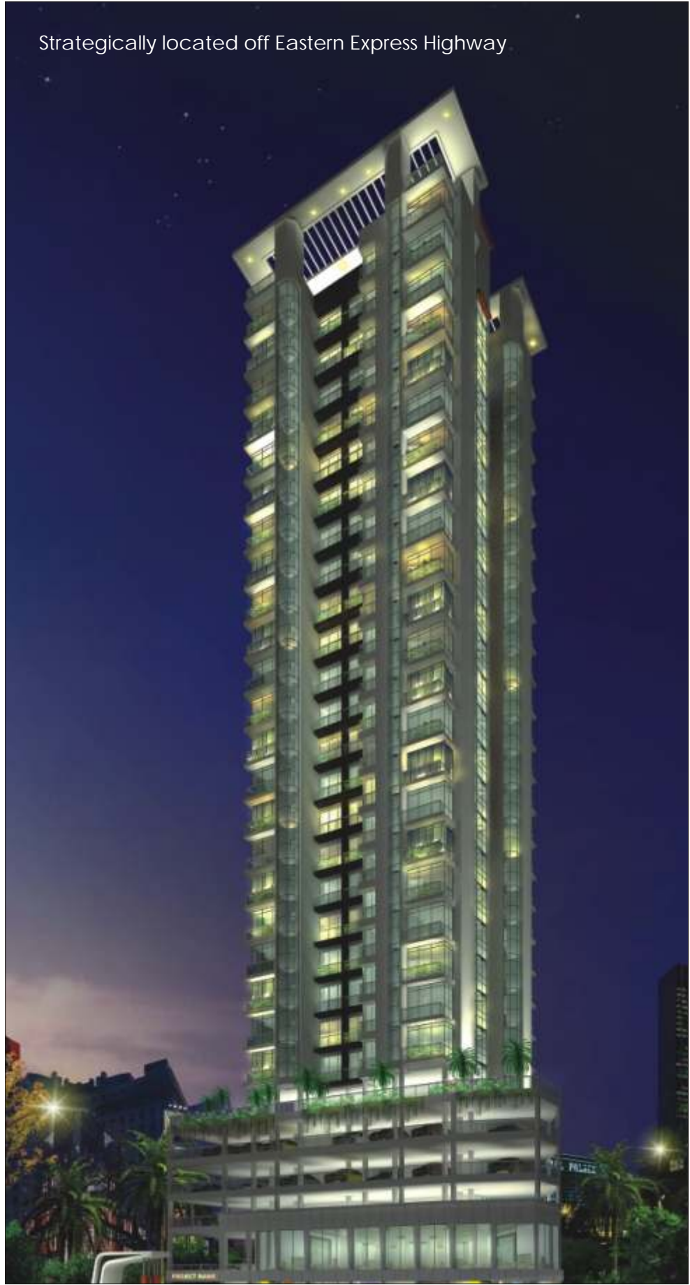
Strategically located off Eastern Express Highway