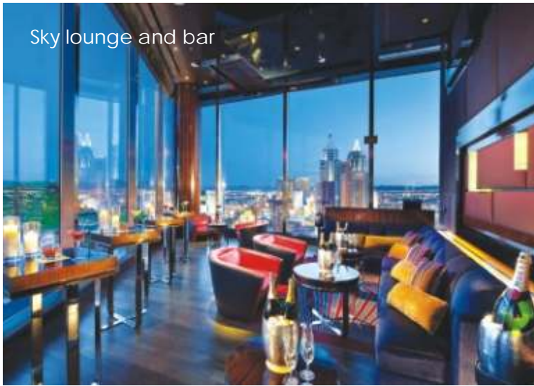
Sky lounge and bar