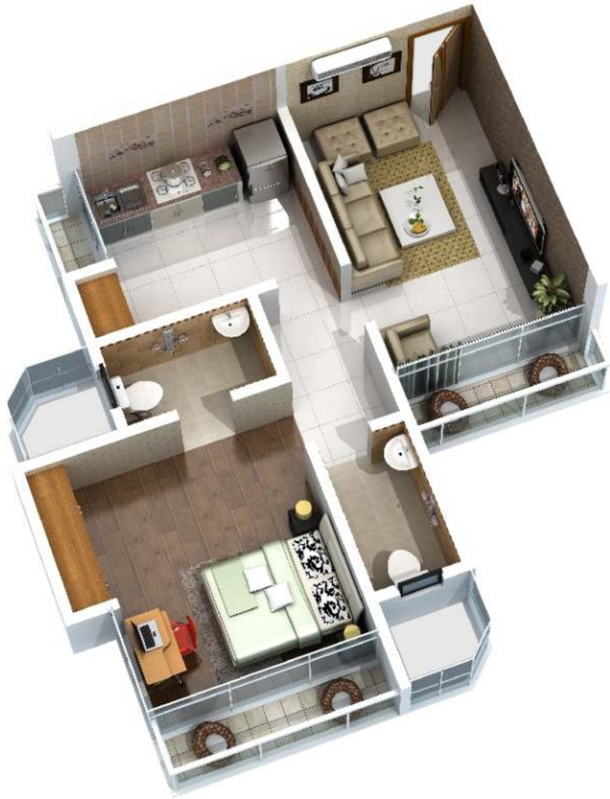
Exclusive 1 BHK