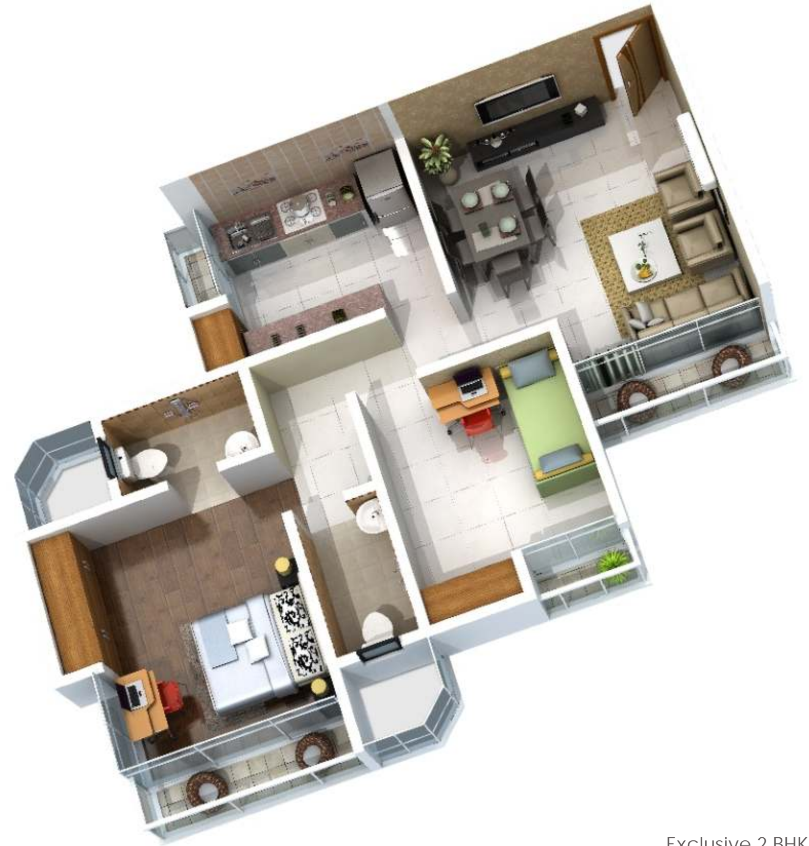
Exclusive 2 BHK