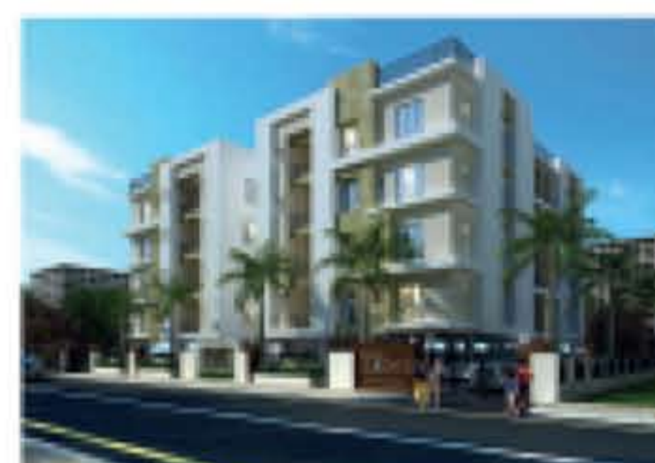
PRIMARC ASPIRA A residential project at Hazra