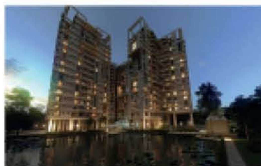
ASTITVA Kolkata's first Gold-Rated Green residential building at Kankurgachi.

A MARKET LEADER IN REAL ESTATE 18 COMPLETED, ONGOING AND UPCOMING PROJECTS