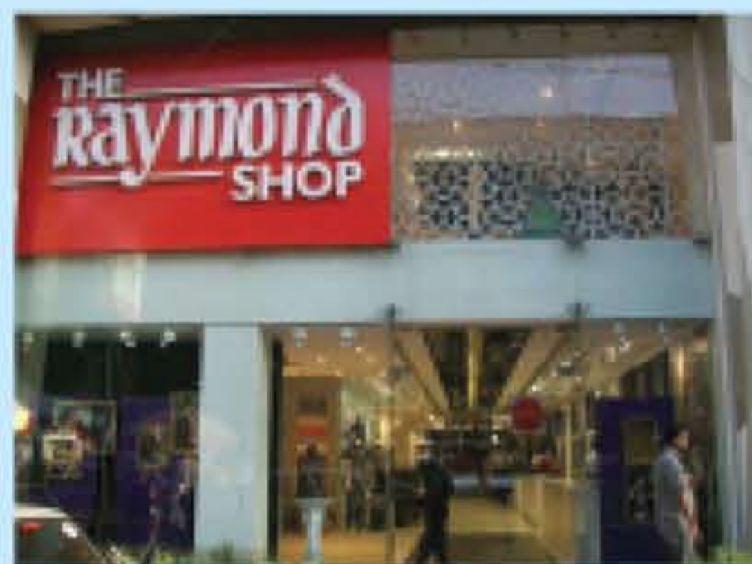
Raymond - The master franchisee for the popular suit and apparel brand. 36 stores in West Bengal, Odisha and Jharkhand.