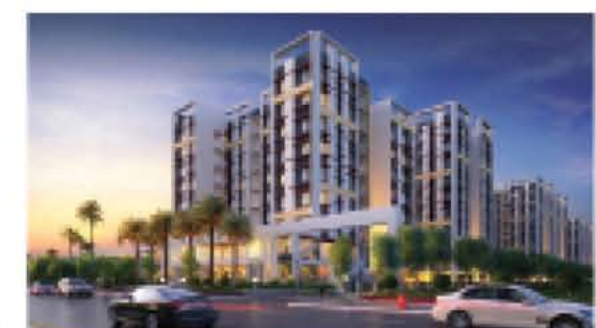
AURA One of the tallest buildings at Mankundu, Hooghly