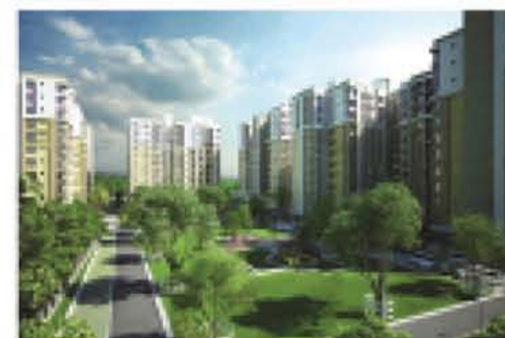
SOUTHWINDS A residential project that lets one 'live more.' Near Garia, EM Bypass.