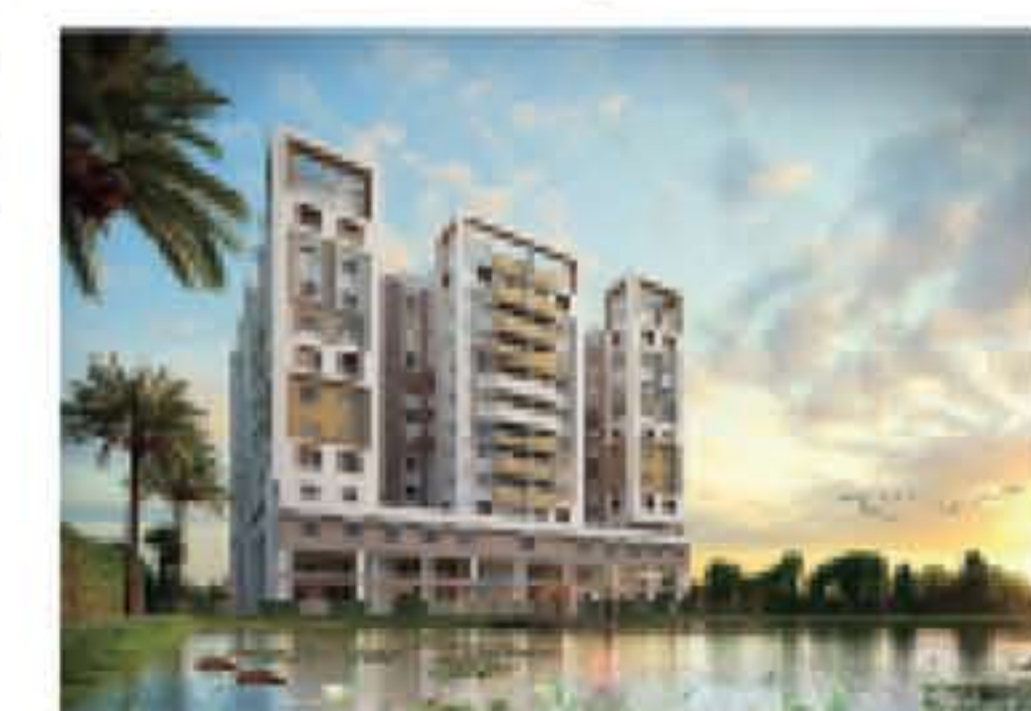
GANGETICA Chandernagar's first high rise that offers community living