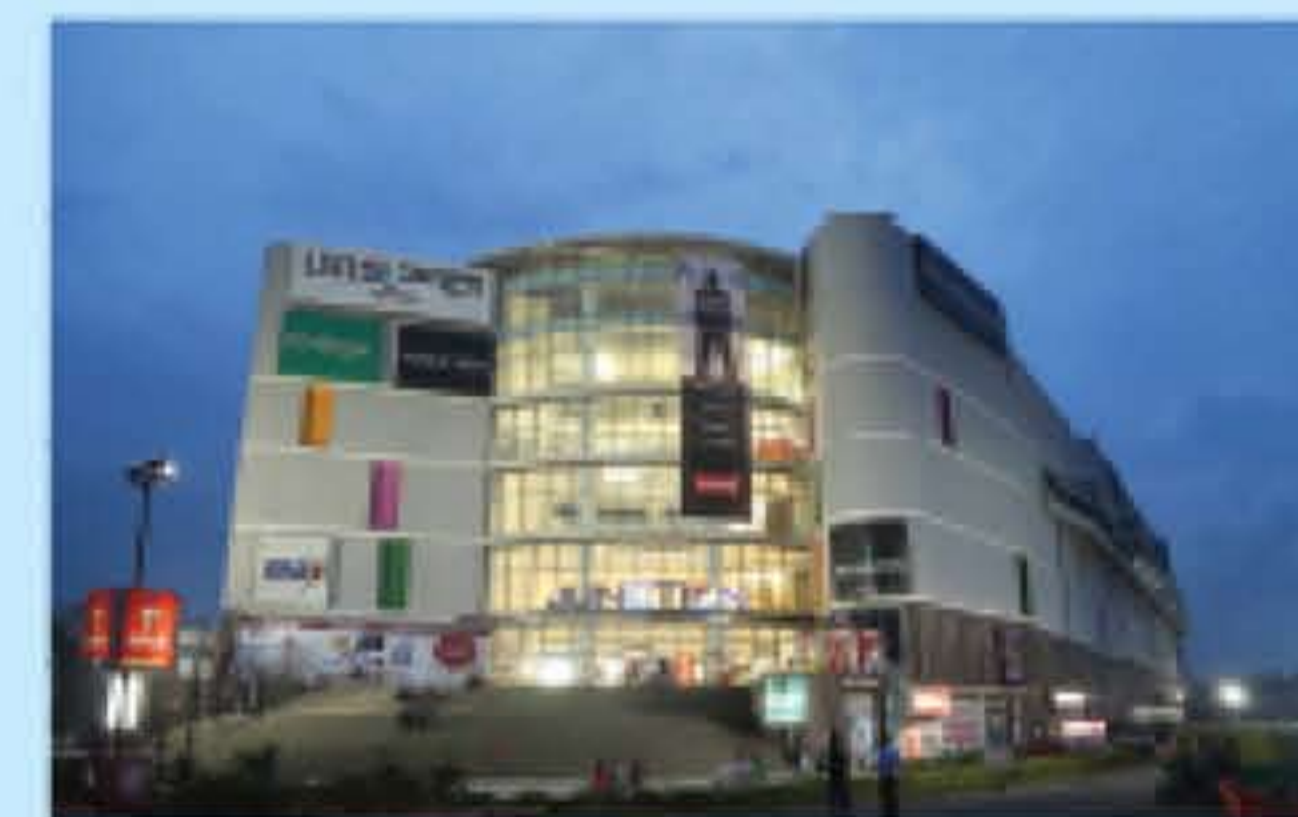
Junction - The biggest mall in South Bengal outside Kolkata. Spread over 4-35 lakh square feet. 10,000 plus footfalls per day.

A MARKET LEADER IN REAL ESTATE 18 COMPLETED, ONGOING AND UPCOMING PROJECTS