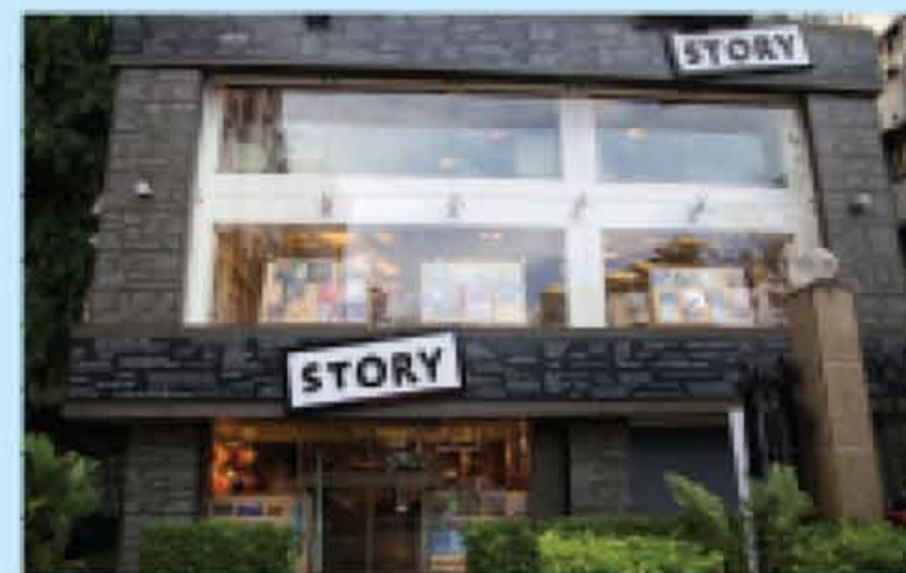
Story - The one-stop destination for books, toys, pens, gifts, stationery and a cafe. 4 Stores at Elgin Road Diamond City, North Junction Mall | Avant Mall.