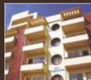
SAI SOWPARNIKA Near ITPL