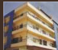
SOWPARNIKA ABODE AECS Layout, Kundanahalli