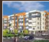
SOWPARNIKA CHANDRAKANTHA Off Sarjapur Road, Bangalore