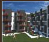
ROYALE SPLENDOUR Vijayanagar 3rd Stage, Mysore