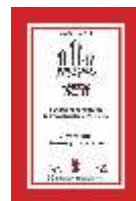
Affordable Housing of the Year NDTV Profit Real Estate Awards 2012

Bangalore | Thiruvananthapuram | Coimbatore | Mysore | Changanassery | Tirupur