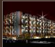
SOWPARNIKA SAI SRISHTI Near Hoskote