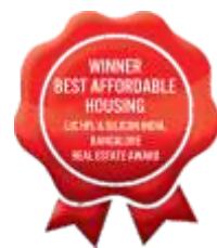
WINNER BEST AFFORDABLE HOUSING SOWPARNIKA SAI SRISHTI BANGALORE REAL ESTATE AWARDS