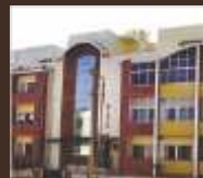
SOWPARNIKA USHA KIRAN AECS Layout, Kundanahalli