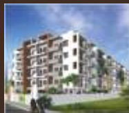
SOWPARNIKA ANANDA Sarjapur Road