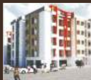
SOWPARNIKA SKANDAGIRI Coimbatore