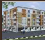
SOWPARNIKA SAI GOPAL Coimbatore