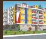
SOWPARNIKA SKANDA Near Hoodi Village