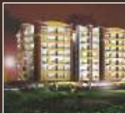
SOWPARNIKA SWASTIKA Bangalore