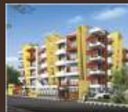
SOWPARNIKA SAIKRISHNA Sarjapur Road, Bangalore