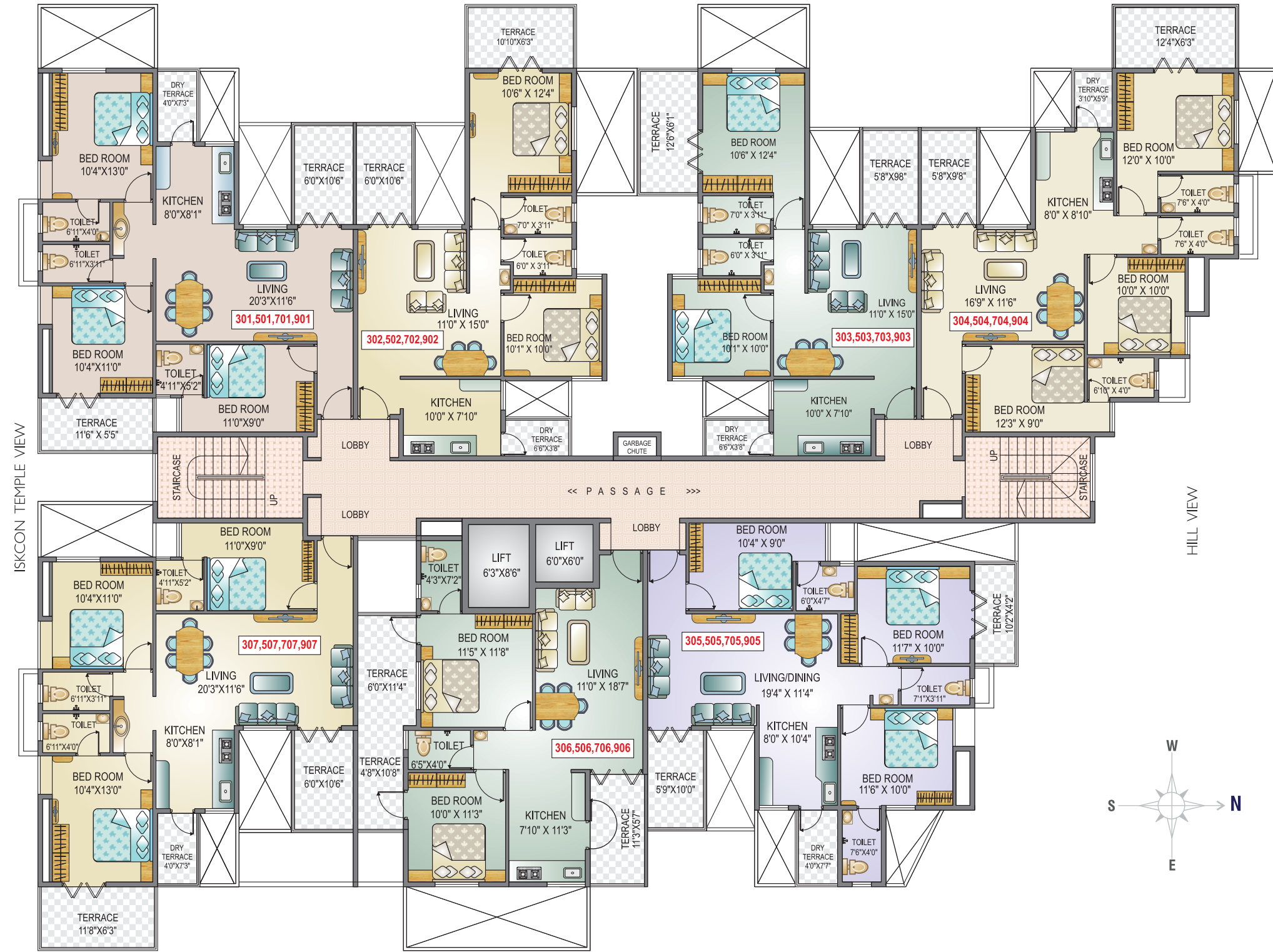
THIRD, FIFTH, SEVENTH, NINTH FLOOR PLAN