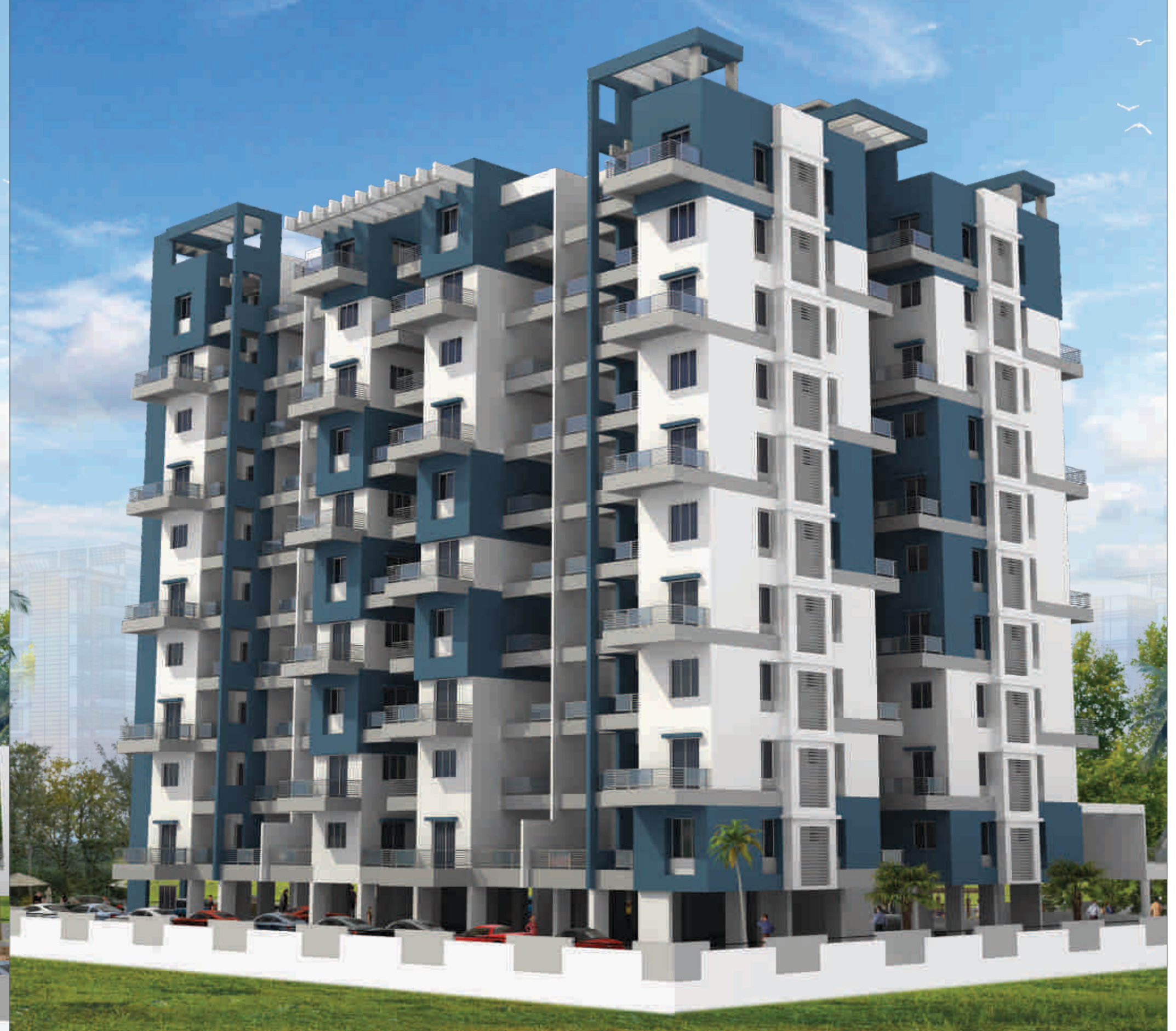
ISKCON TEMPLE VIEW