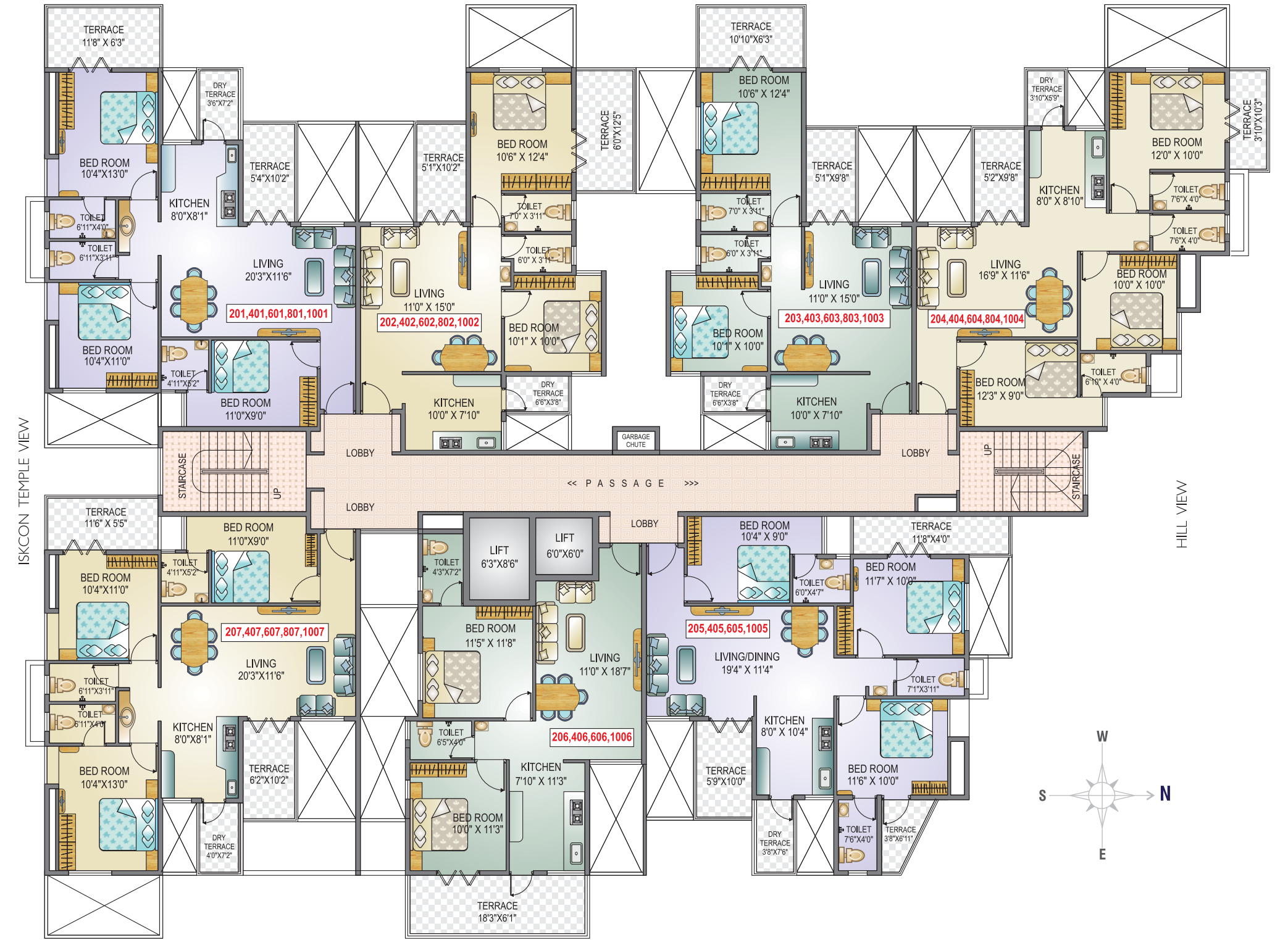
SECOND, FOURTH, SIXTH, EIGHTH, TENTH FLOOR PLAN