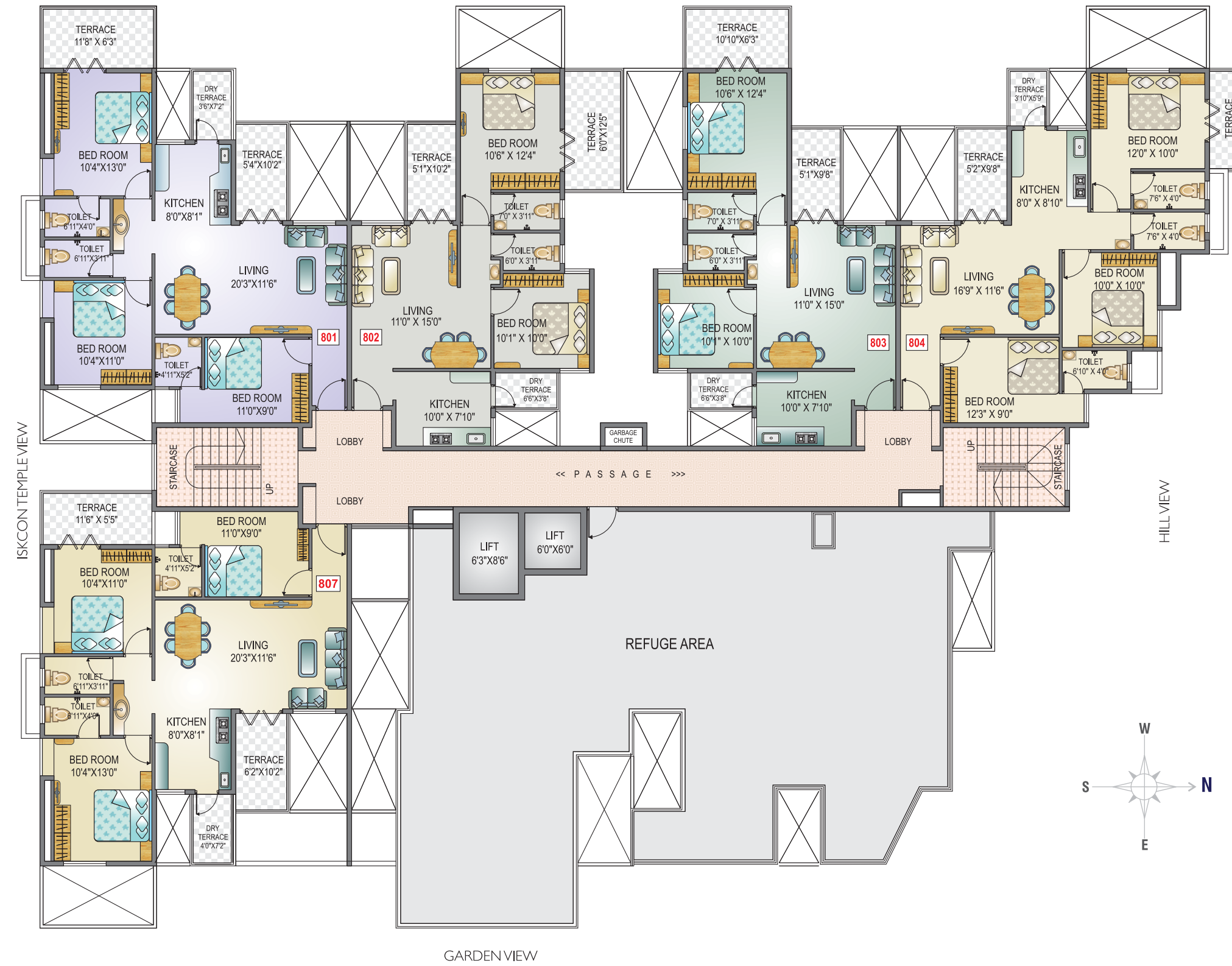
EIGHTH FLOOR PLAN