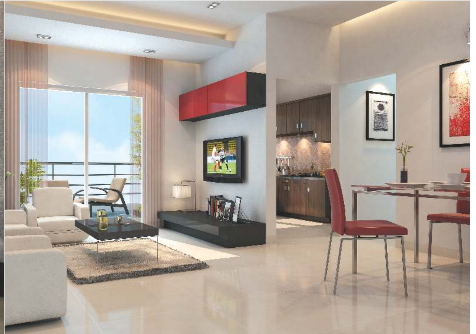
🌿 View Of Dining Through to Living room and Kitchen