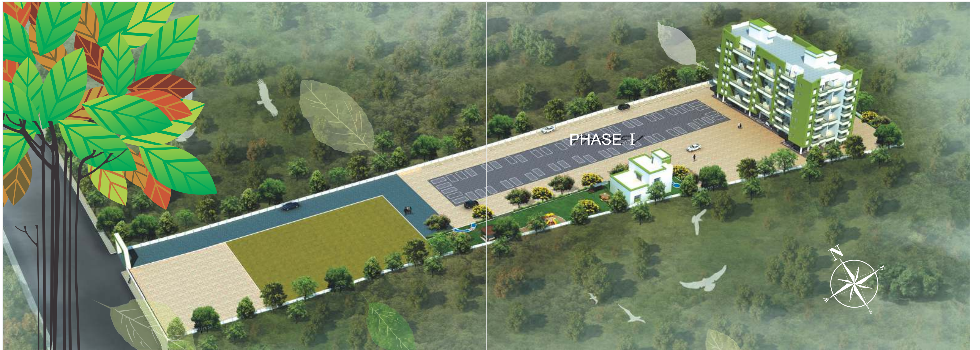
Bird's Eye View of Greenfield Phase II