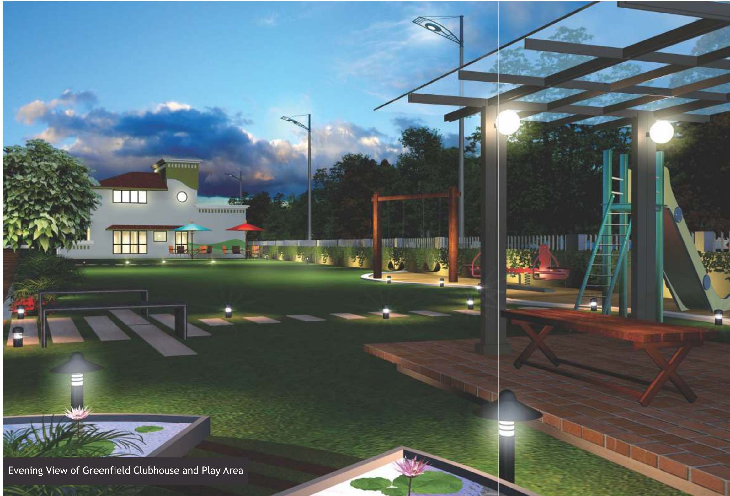
Evening View of Greenfield Clubhouse and Play Area