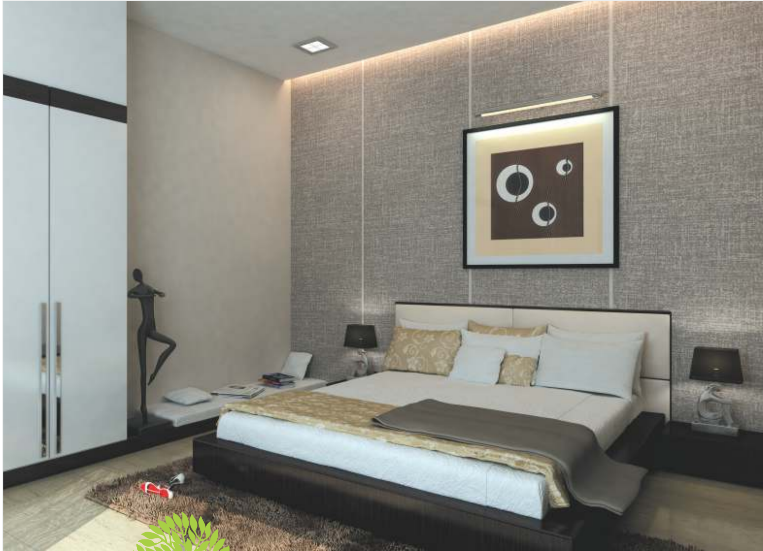
View Of Master Bedroom 🌿