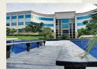
Infosys - Financial District