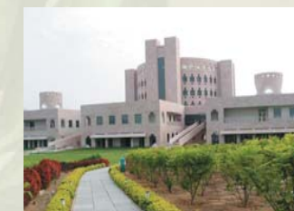
ISB - Indian School of Bussiness