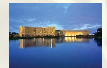
Novatel - Hotel