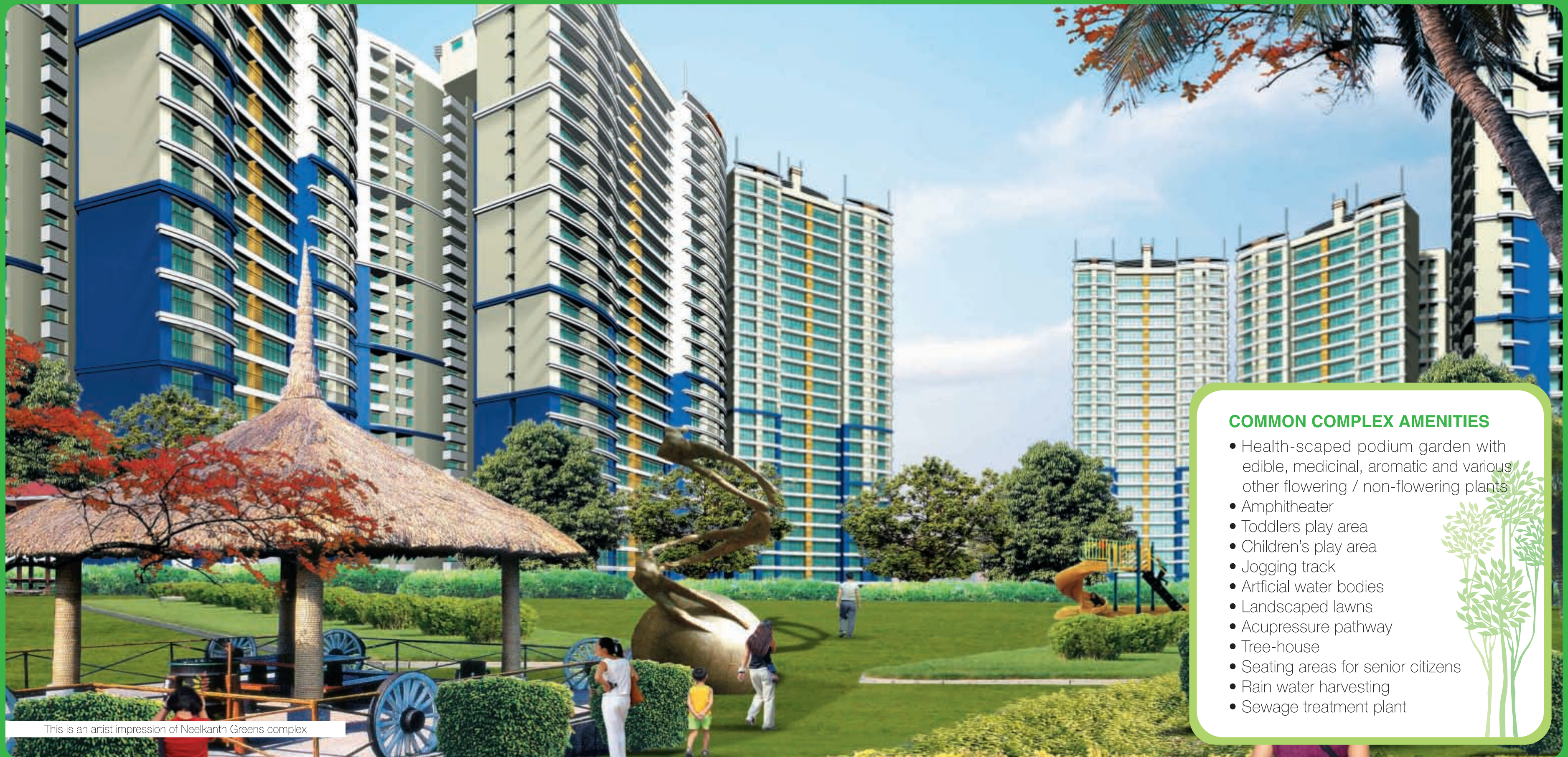
This is an artist impression of Neelkanth Greens complex