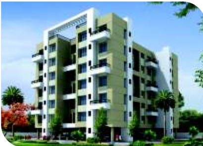
GULMOHAR HELIOS Kharadi