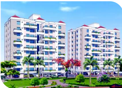
GULMOHAR ORCHIDS Kharadi