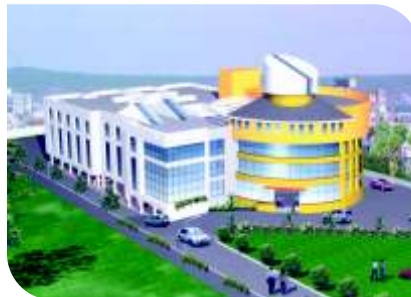
GULMOHAR IT PARK Nagar Road