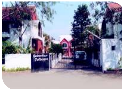
GULMOHAR COTTAGES Viman Nagar