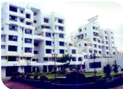
GULMOHAR HABITAT Wanowrie