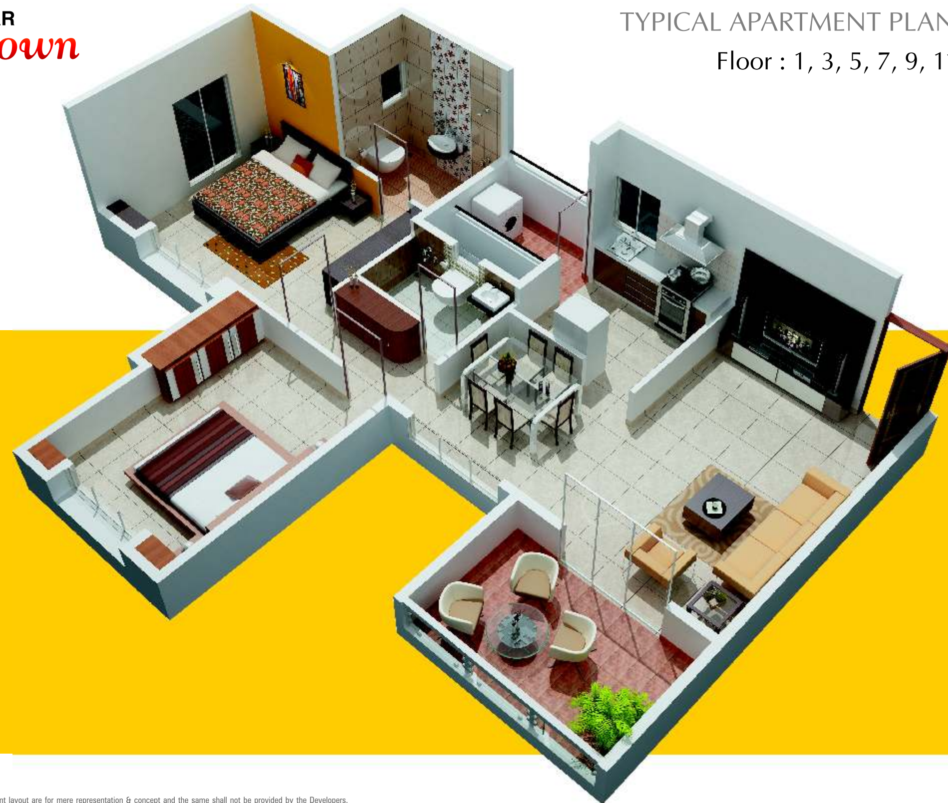
TYPICAL APARTMENT PLAN Floor : 1, 3, 5, 7, 9, 11

The furniture and fixtures shown in the apartment layout are for mere representation & concept and the same shall not be provided by the Developers.