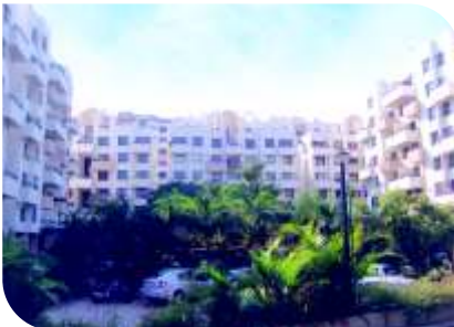
GULMOHAR CITY Kharadi