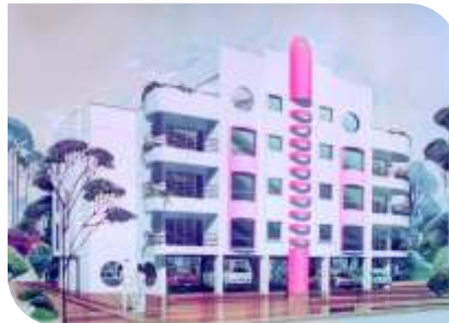
GULMOHAR COURT Koregaon Park