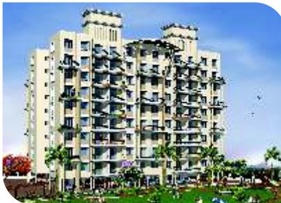
GULMOHAR PRIVILEGE Kharadi