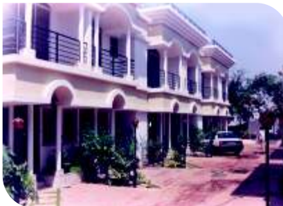
GULMOHAR REGENCY Viman Nagar