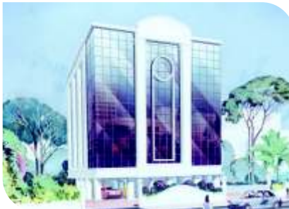
GULMOHAR CENTRE POINT Nagar Road