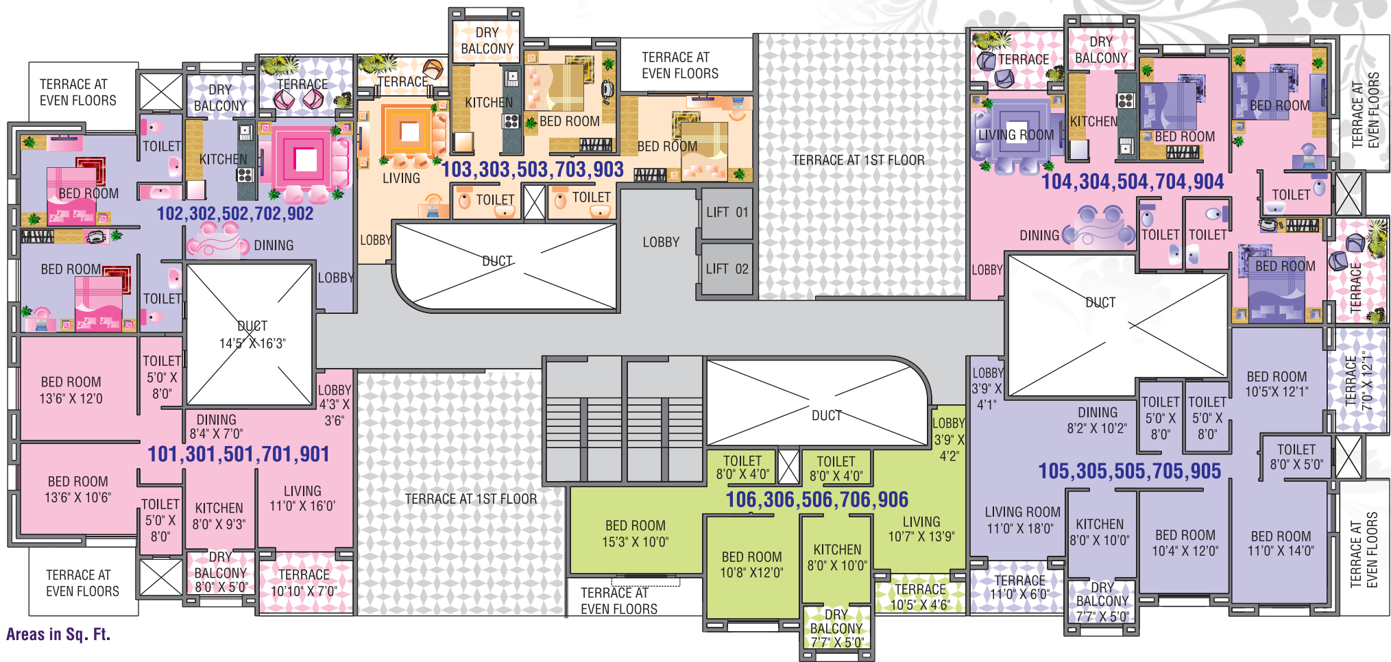
Areas in Sq. Ft.