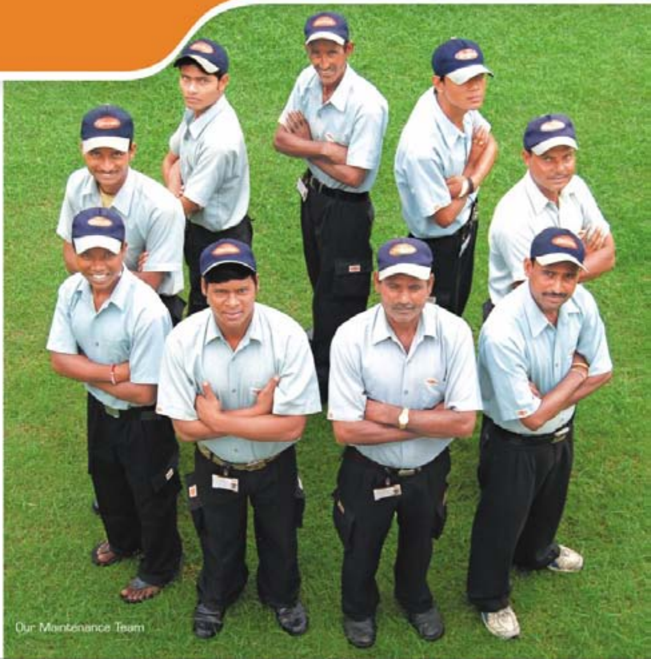
Our Maintenance Team

All this is possible because of Ashiana maintenance services, which has trained professionals to carry out maintenance activities in the field of civil, electrical, mechanical, sanitation, water supply, security, horticulture so that the homes retain their initial appearance for years to come.