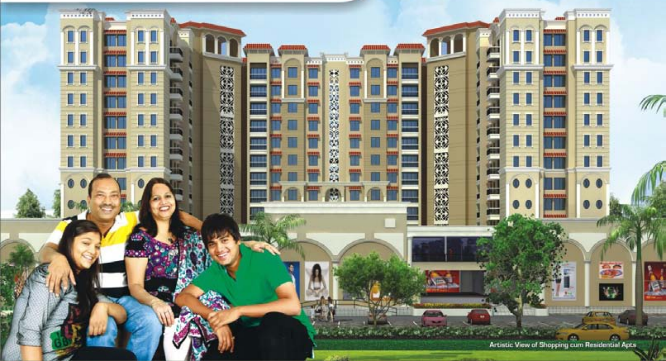
Artistic View of Shopping cum Residential Apts