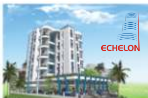
2 nd /3 rd BHK LIFESTYLE CONDOMINIUMS BANER- PASHAN LINK RD