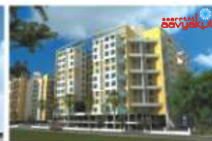
2 & 3 BHK APARTMENTS NEAR EKLAYA COLLEGE - KOTHRUD