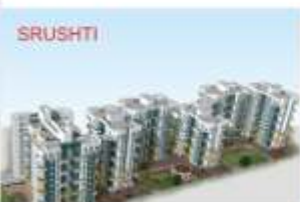
2/3 BHK APARTMENTS KOTHRUD

Our projects are recognized landmarks of Pune, located in prime areas like Bhandarkar Road, Model Colony, Paud Road, Kothrud, Aundh, Baner, Pashan, Bavdhan etc. Our group is currently developing over 8,50,000 sq. ft. of plush realty in the prime locations of Baner, Bavdhan & Kothrud. We have also expanded the breadth of our realty operations to other fast emerging Tier I and II cities like Nasik, Kolhapur and Navi Mumbai.