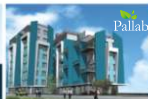
2 BHK PREMIUM APARTMENTS NEAR EKLAYA COLLEGE - KOTHRUD