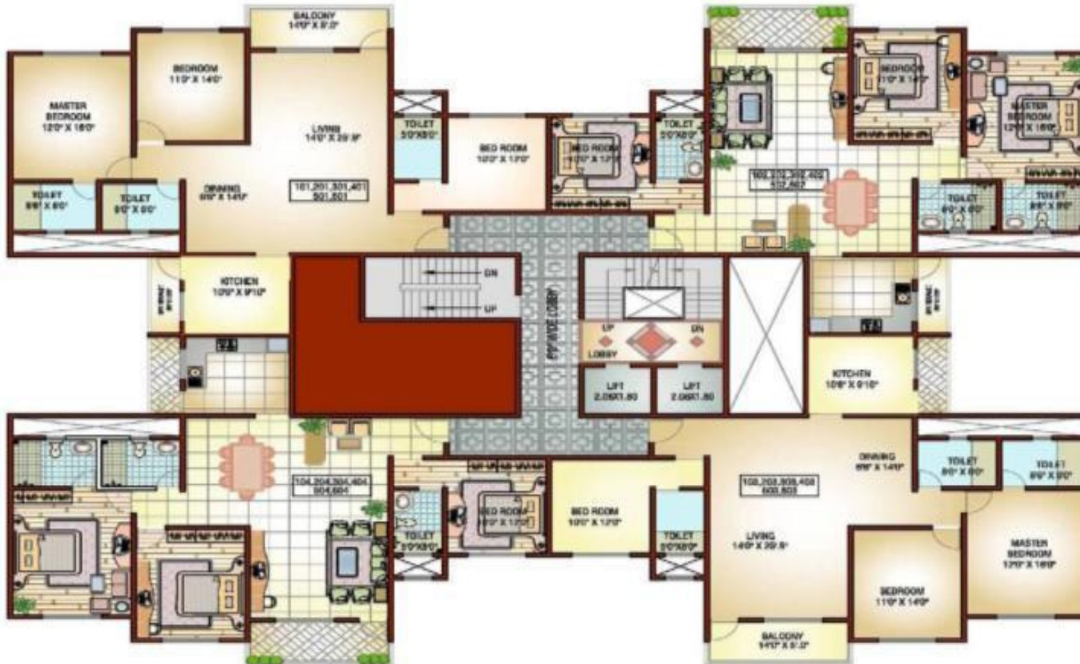
TYPICAL 1ST, 2ND, 3RD, 4TH, 5TH & 6TH FLOOR PLAN