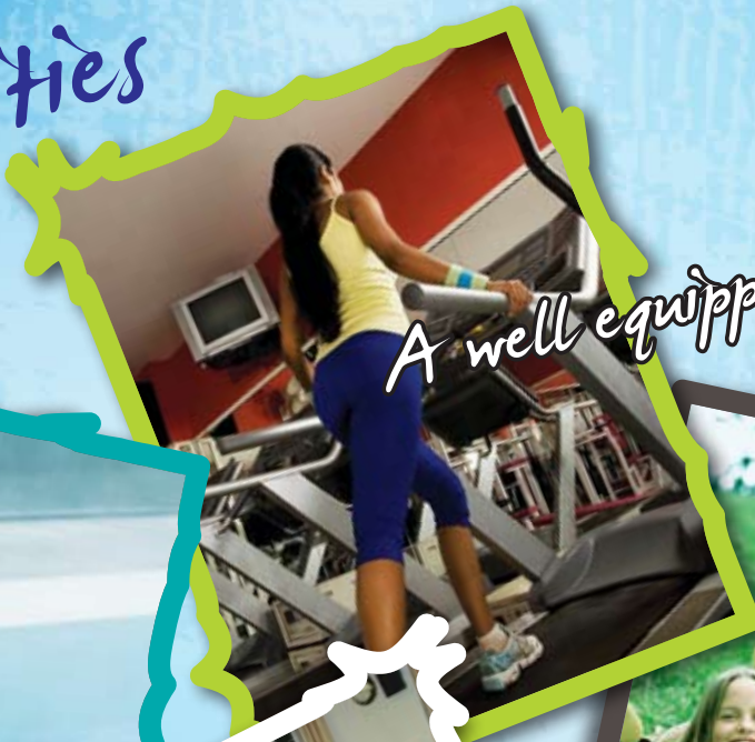
A well equipped gym