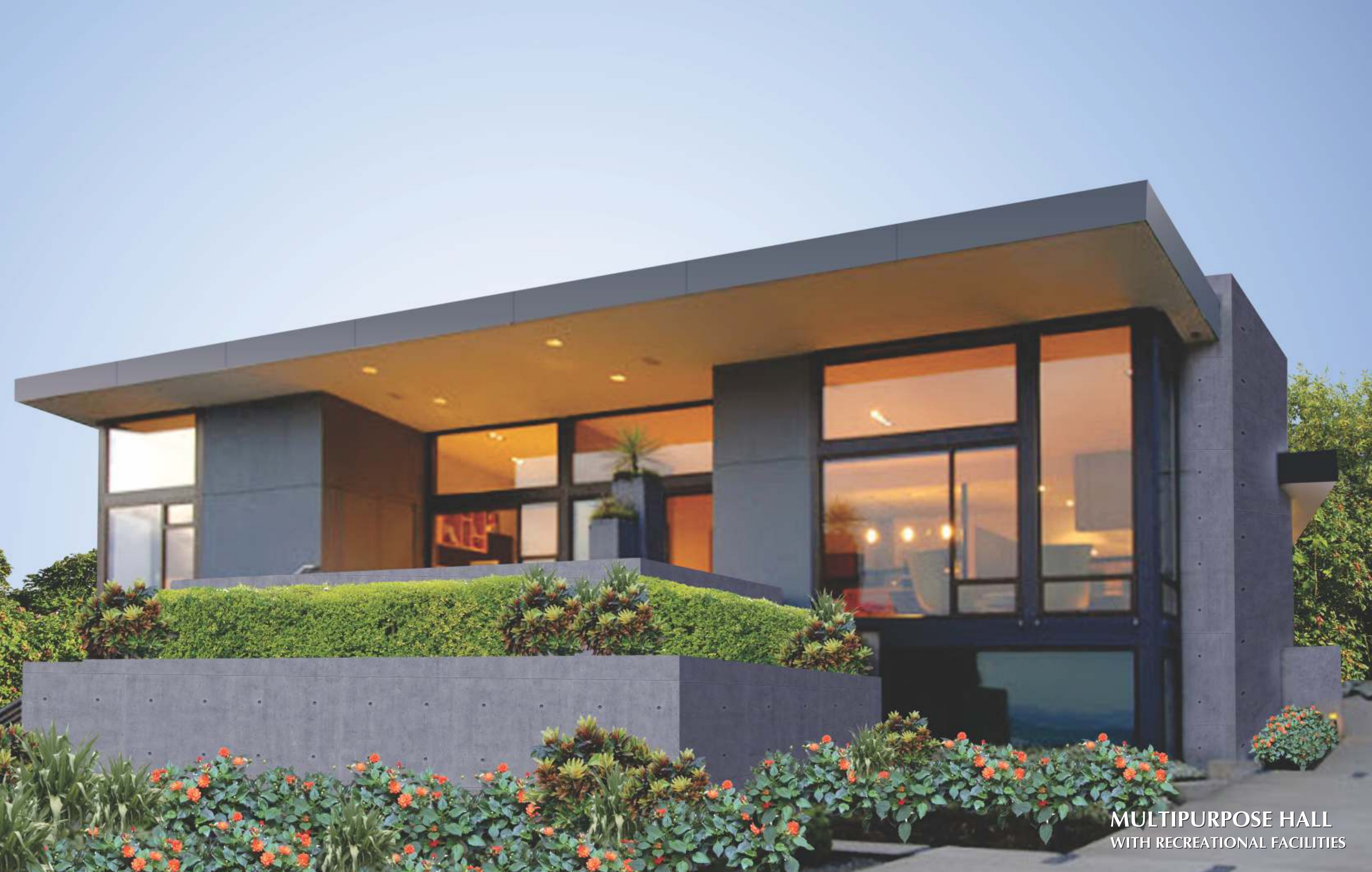
MULTIPURPOSE HALL WITH RECREATIONAL FACILITIES