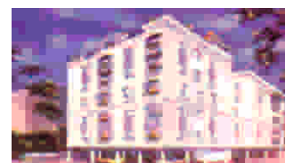
SKV's Adams Arcade