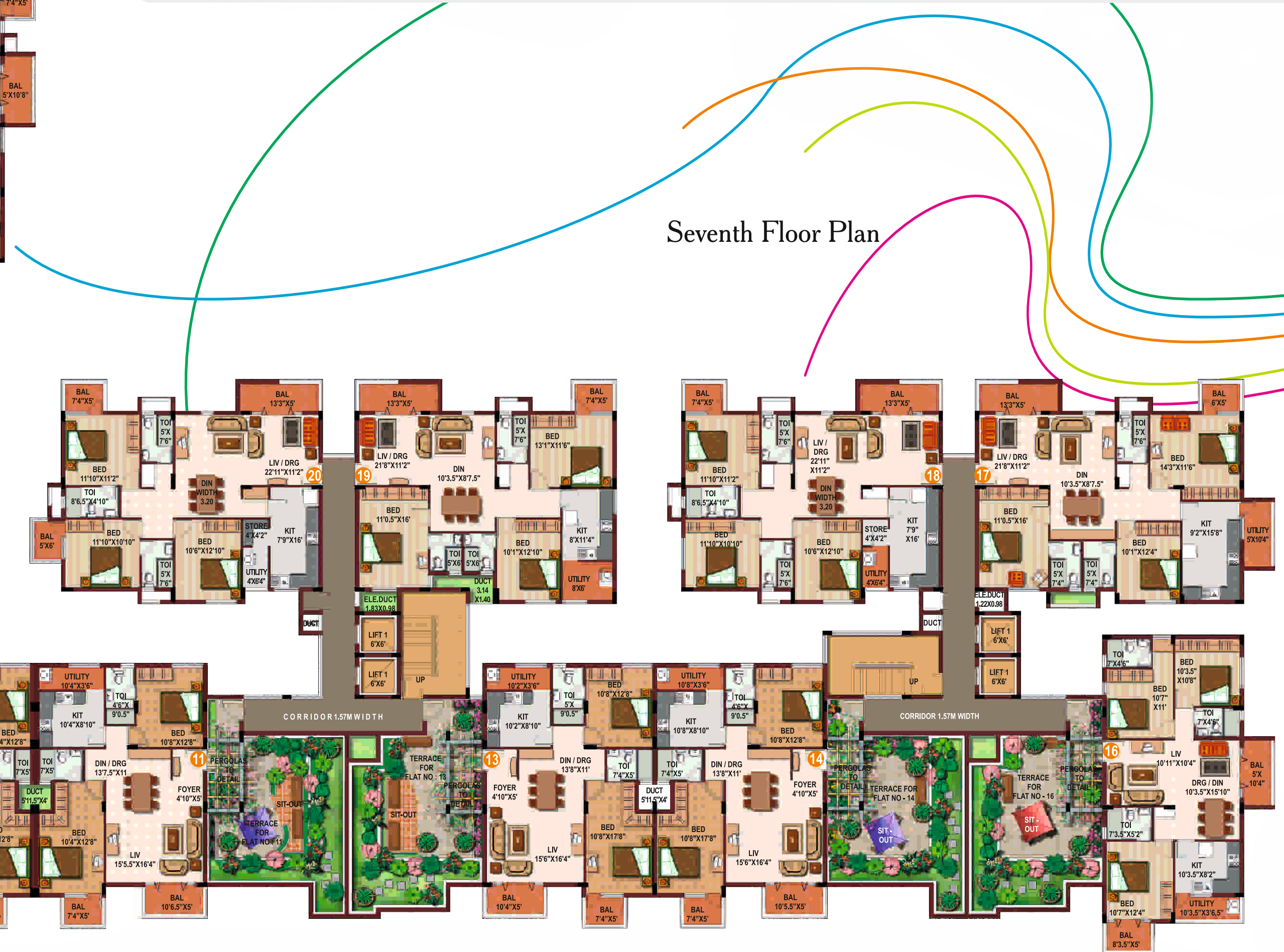
Seventh Floor Plan