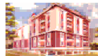
SKV's Park View