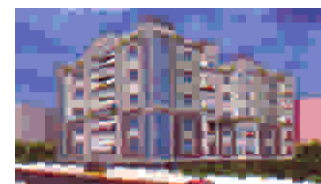
SKV's Sulochana Sadan