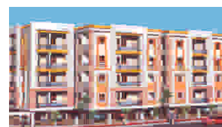
SKV's Royal Pavilion