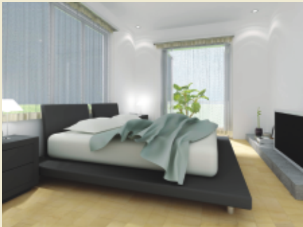
You are distinct; so is your sleep. Keep it precious.