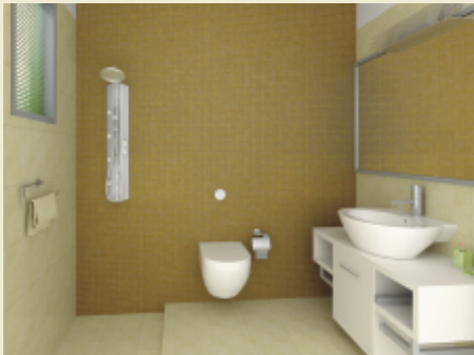
Great mornings make great days!