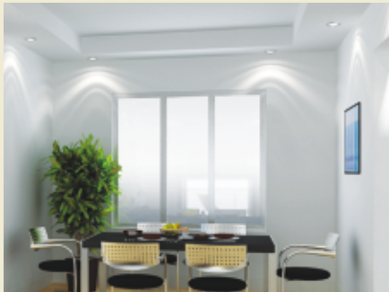
A mini banquet hall or your plush dining room; it's one & the same...