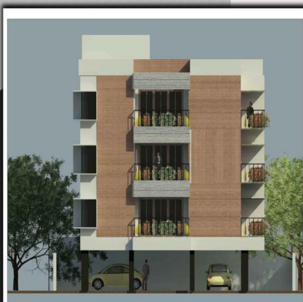
CRV DEW FRONT ELEVATION