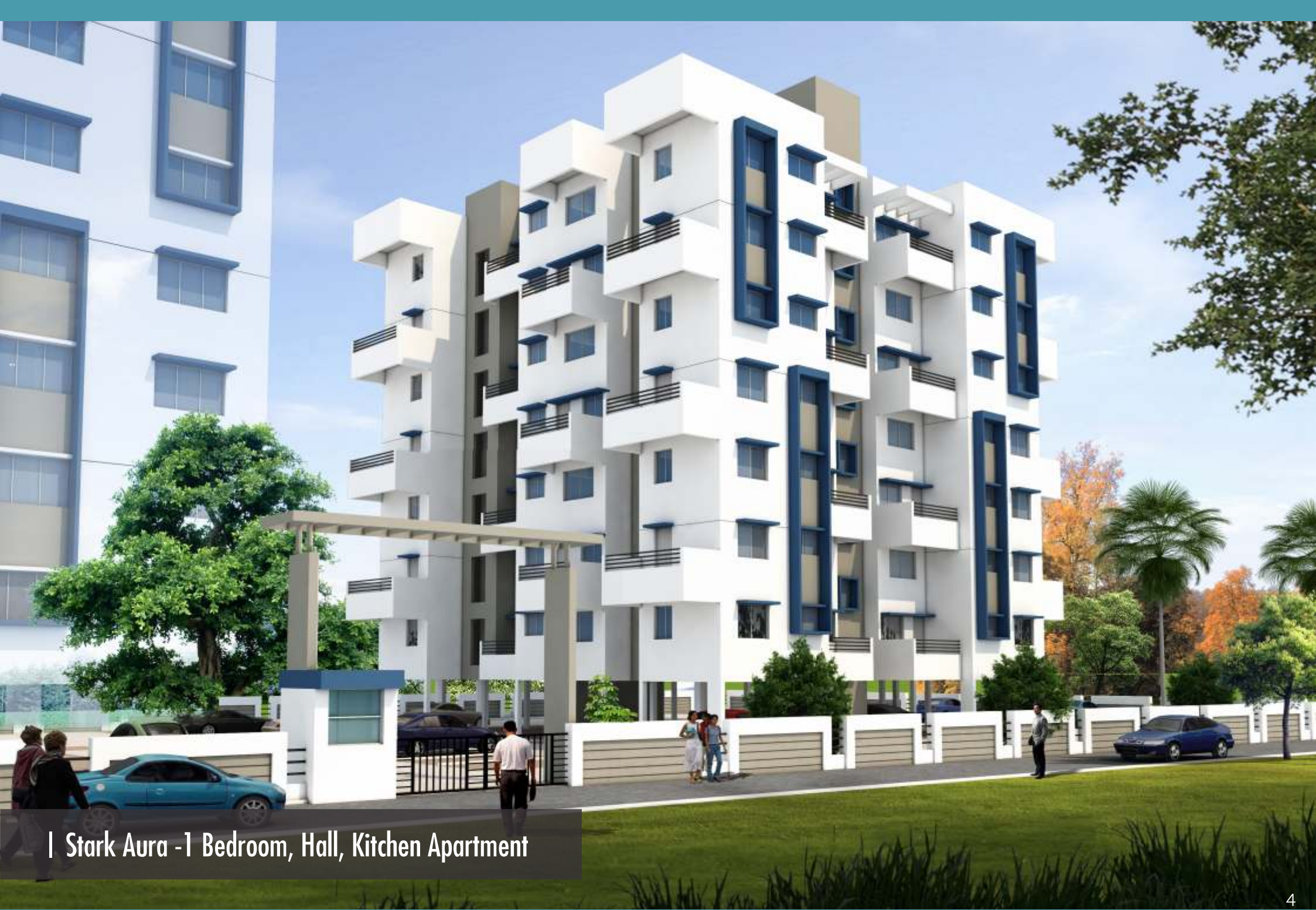
| Stark Aura -1 Bedroom, Hall, Kitchen Apartment