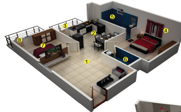
Type 6 (W) 1060 sq.ft