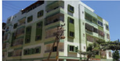
Miyan's Lakshmi Residency- Electronic City