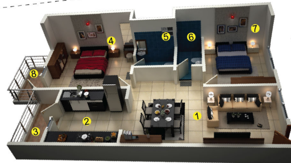
Type 9 (N) 1075 sq.ft