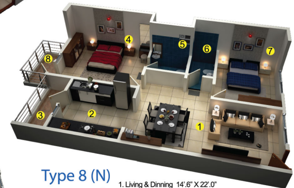
Type 8 (N) 1075 sq.ft