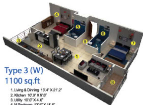
Type 3 (W) 1100 sq.ft