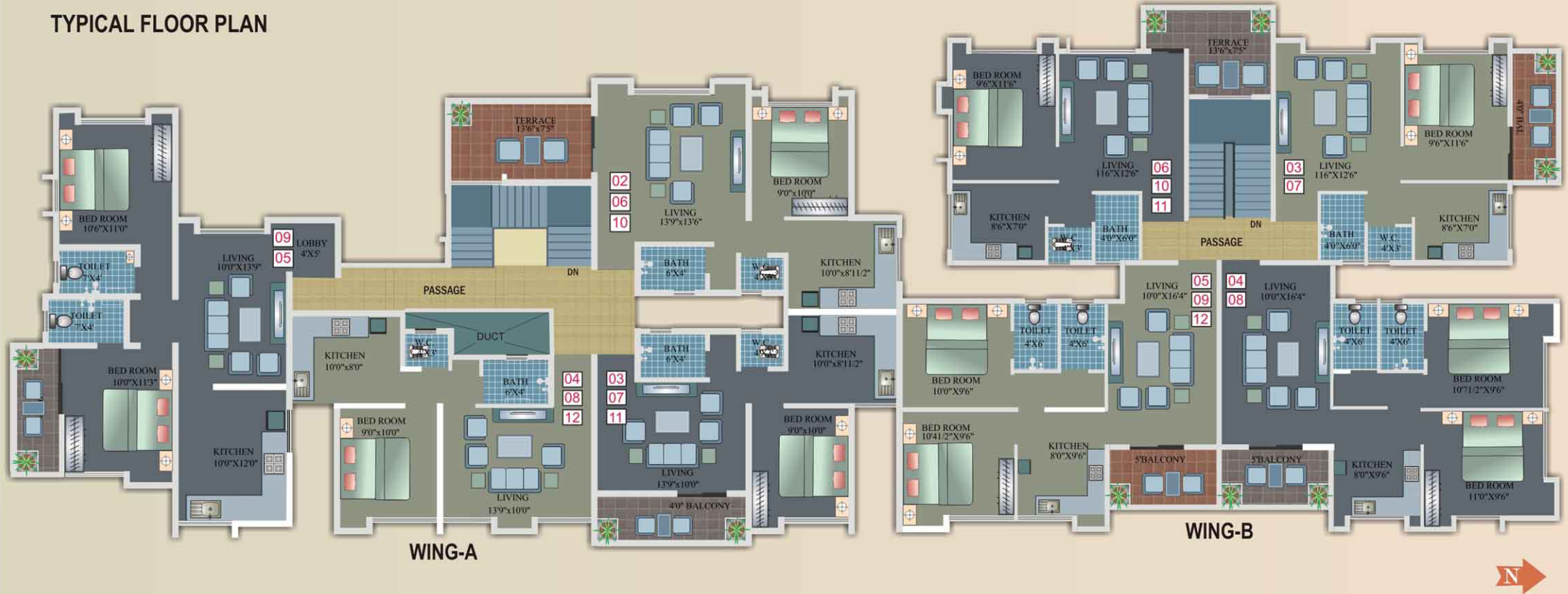
SALEABLE AREA STATEMENT(IN SQ. FT)