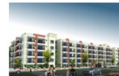
Samhita Serenity (Ongoing)