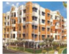
Samhita Spice Wood