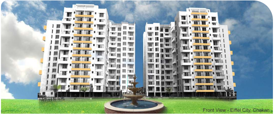
Front View - Eiffel City, Chakan