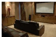
30 Seat Mini Theatre

The exotic boulevard of scenic beauty, vitality and luxury in the lap of nature awaits you as you enter Chakan – The Golden Triangle of Pune, Mumbai & Nashik.