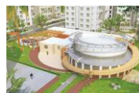
5.5 Acre Landscape Garden