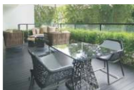
3 Side Open Apartments