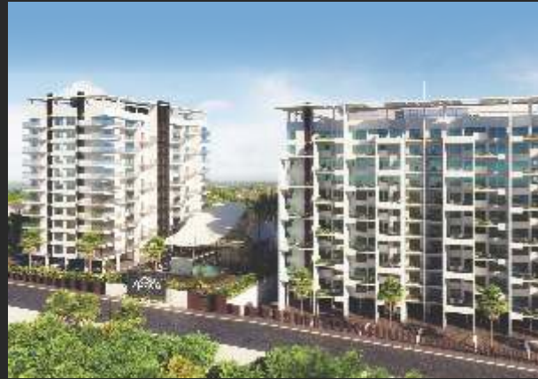
URBAN SPACE 3, 4 BHK and Penthouses | NIBM