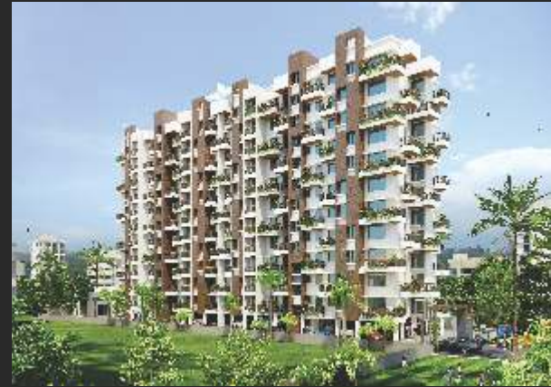
URBAN SOUL 2 BHK | KHARADI