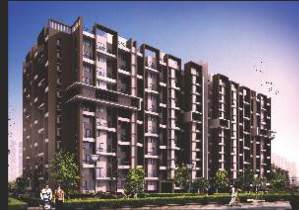
URBAN NEST 1.5, 2 and 3 BHK | UNDRI