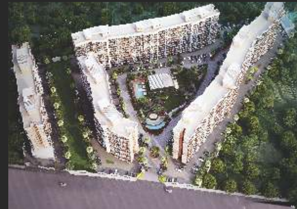
URBAN LIFE 1 and 2 BHK | TALEGAON