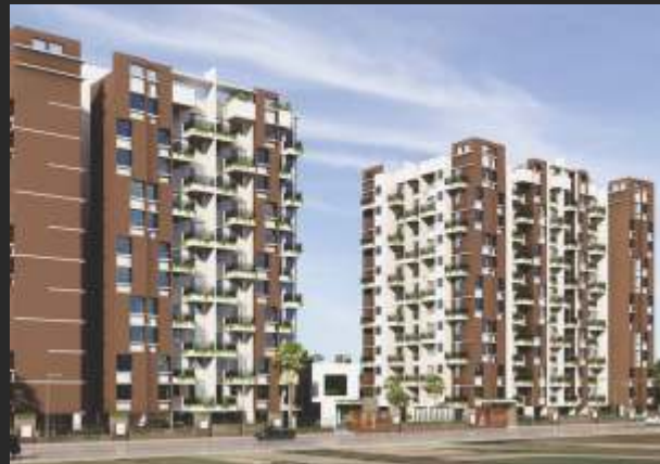
URBAN SENSES 2 and 2.5 BHK | KHARADI