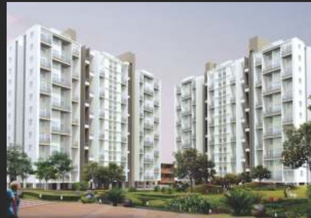
URBAN RISE 1.5 and 2 BHK | PISOLI