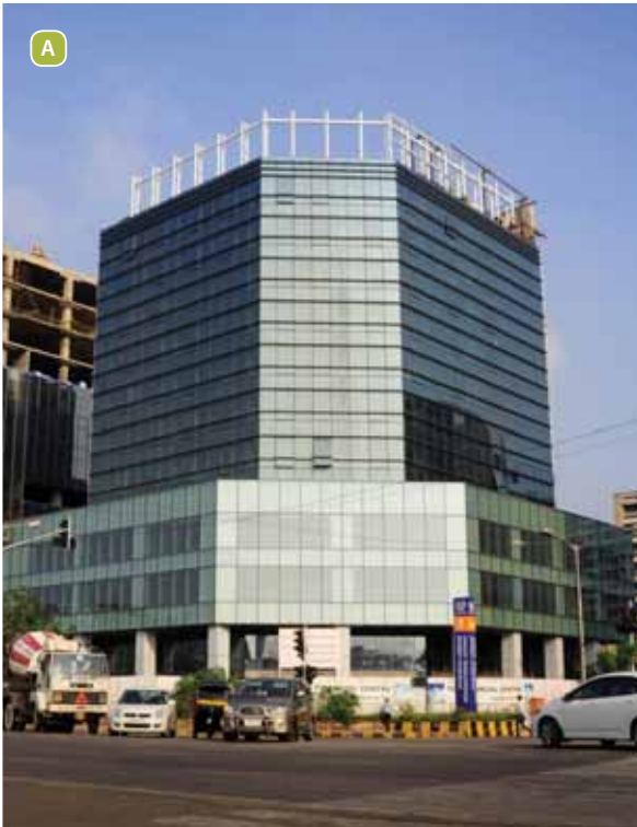
Mumbai / Pune