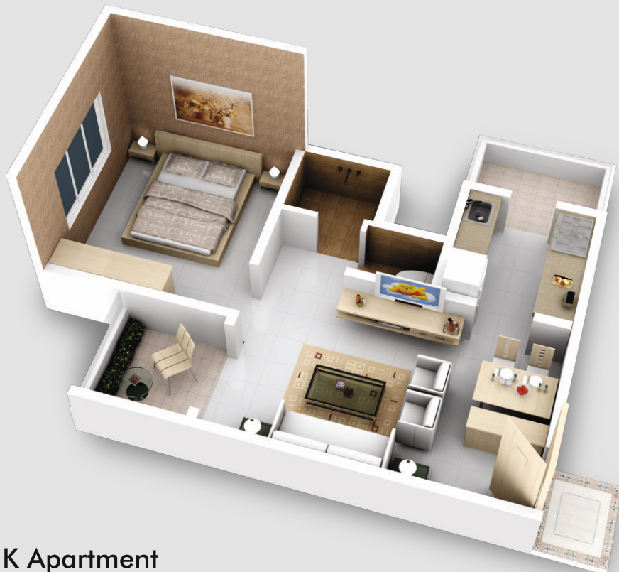
1 BHK Apartment