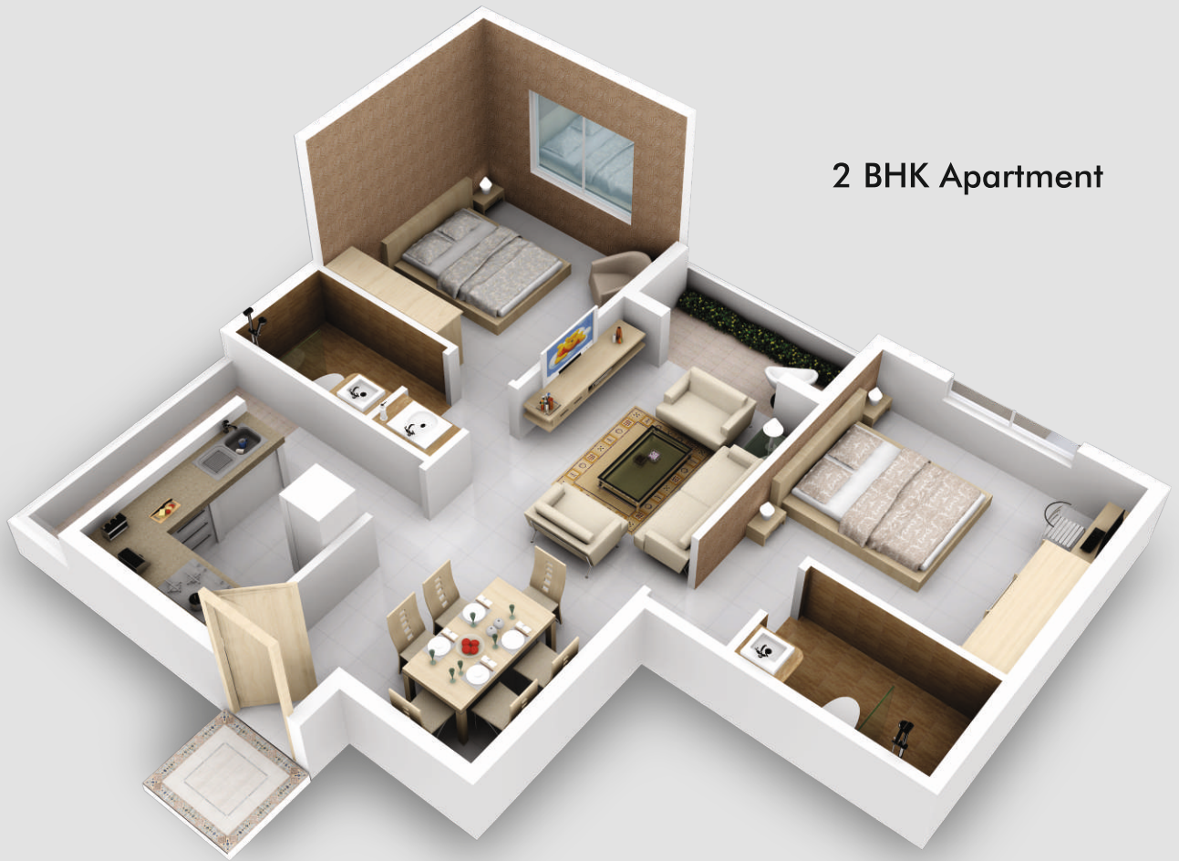
2 BHK Apartment