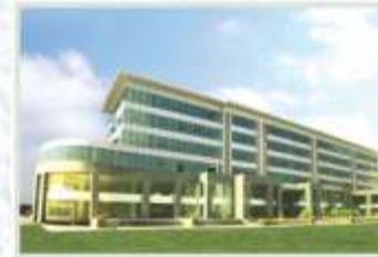
RAINBOW PLAZA - WAKAD