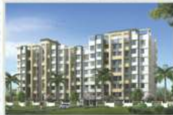
FOREST HILLS - MAMURDI (PCMC)