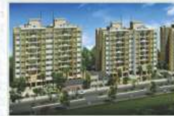
PARK SPRINGS - DHANORI