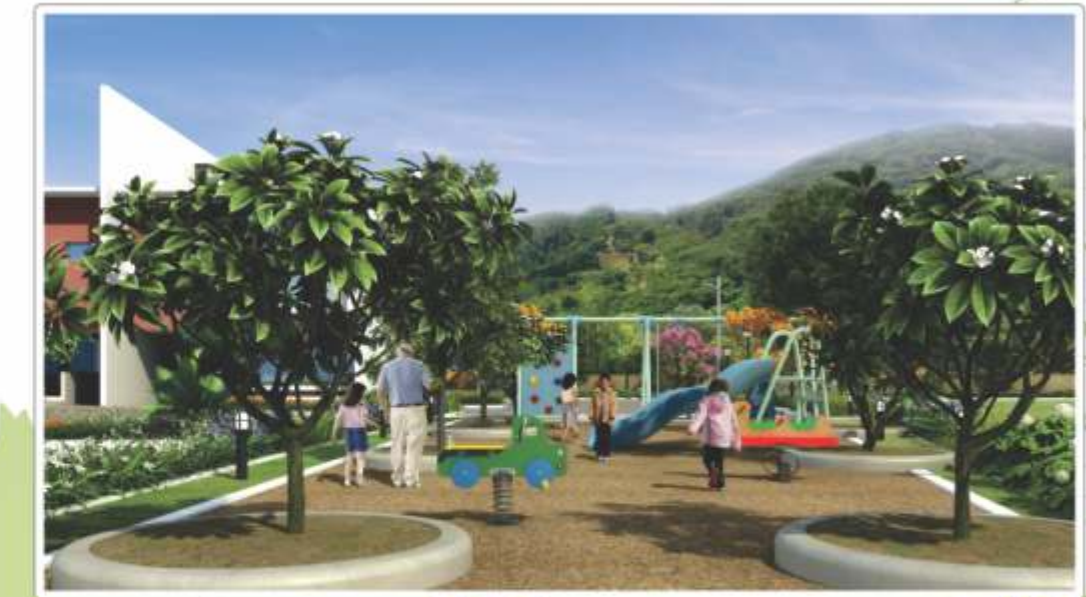
Landscape Garden | Children's Play Area | Club House