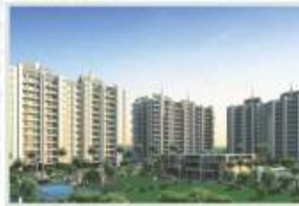
PEBBLES II - BAVDHAN