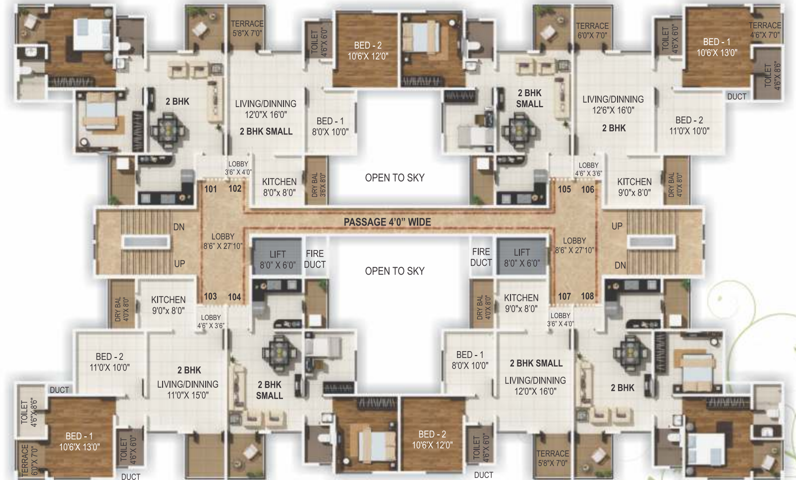
Typical Odd Floor Plan