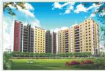
PEBBLES - BAVDHAN