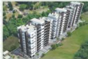
URBAN FOREST - MAMURDI (PCMC)