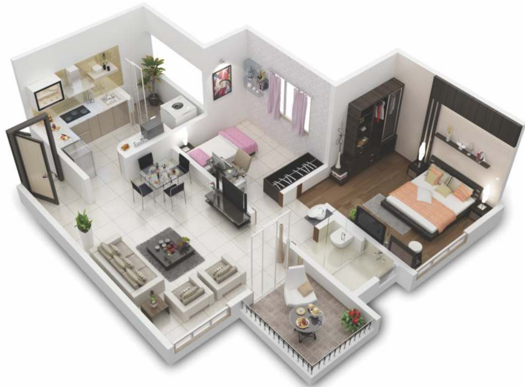
TYPICAL 2 BHK SMALL 783 sq. ft.