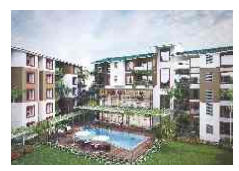
UMIYA - WOODS