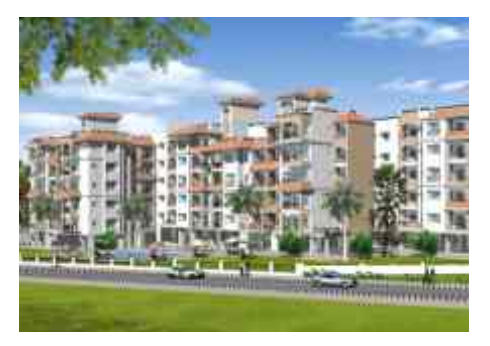
UMIYA - SOLICITUDE