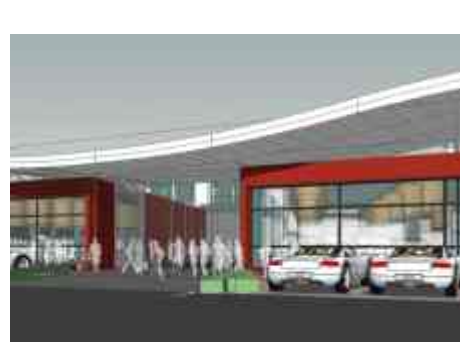
UMIYA - QUATRO COMMERCIAL