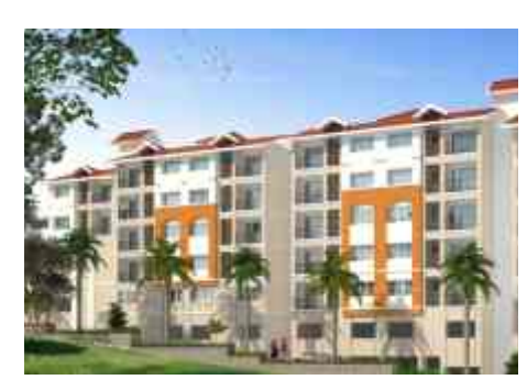
UMIYA - QUATRO PLOT C