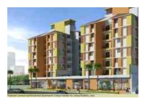
UMIYA - HABITAT