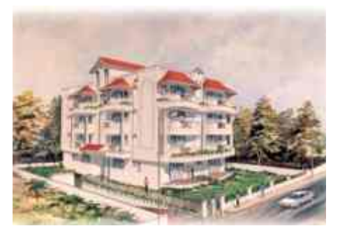
UMIYA - SHANGRI LA