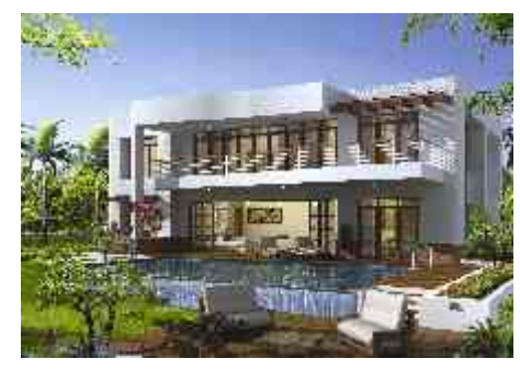
UMIYA - SUNDANCE VILLAS