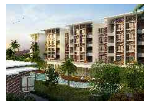
UMIYA - SUNDANCE APARTMENTS