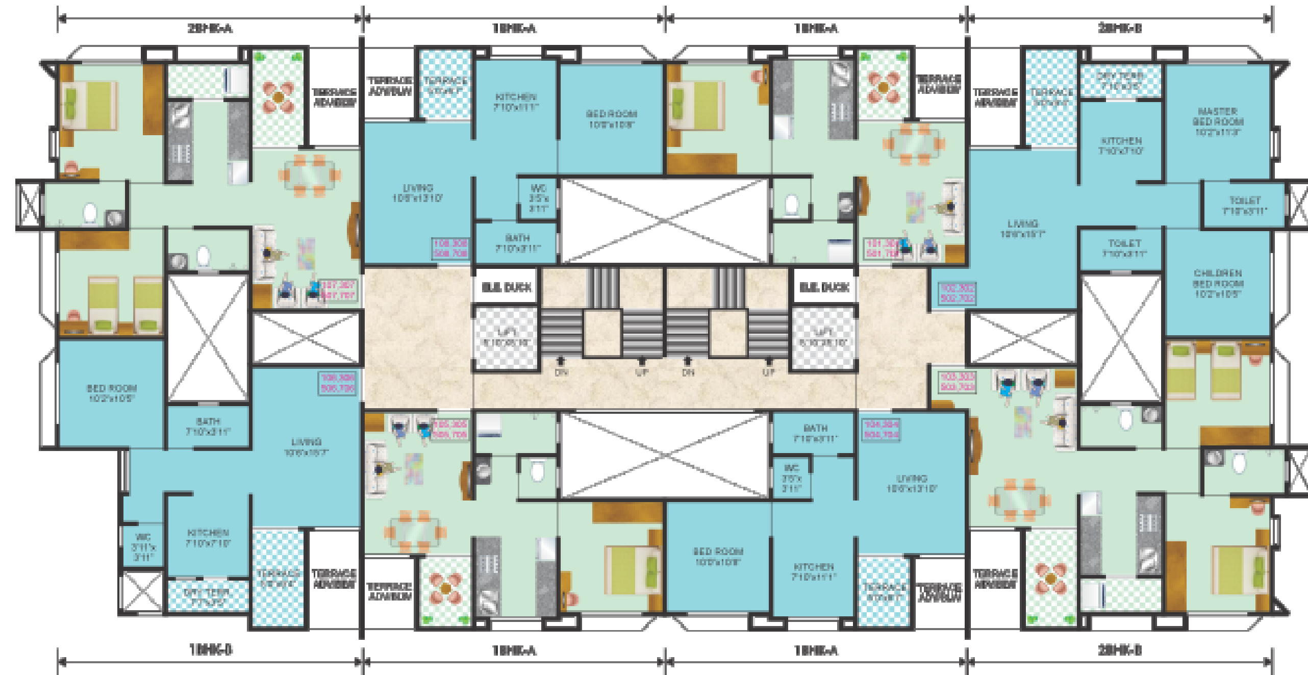
Typical 1 st , 3 rd , 5 th & 7 th Floor Plan