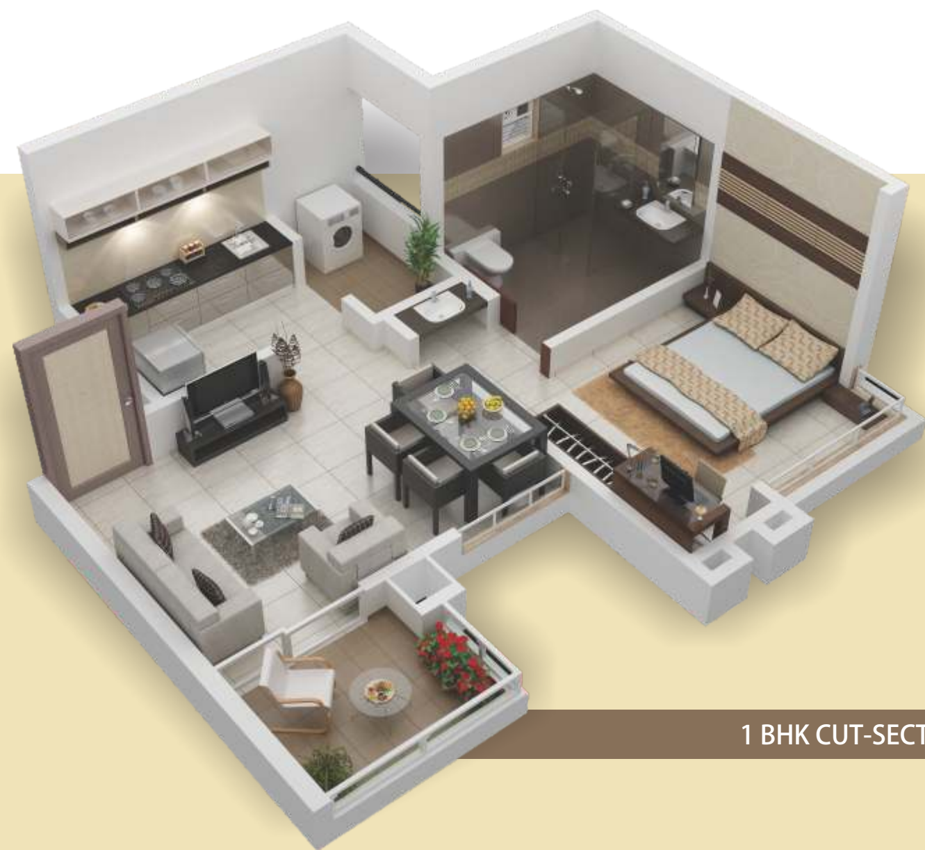
1 BHK CUT-SECTION