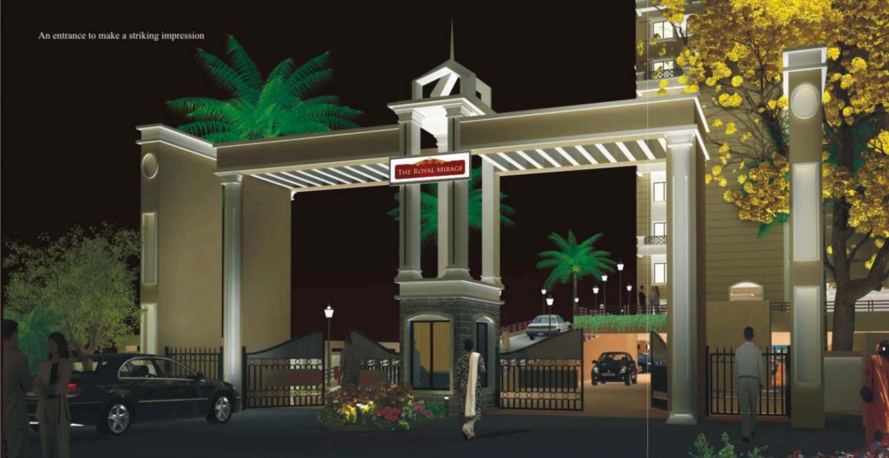
LAYOUT TOP VIEW

An entrance to make a striking impression