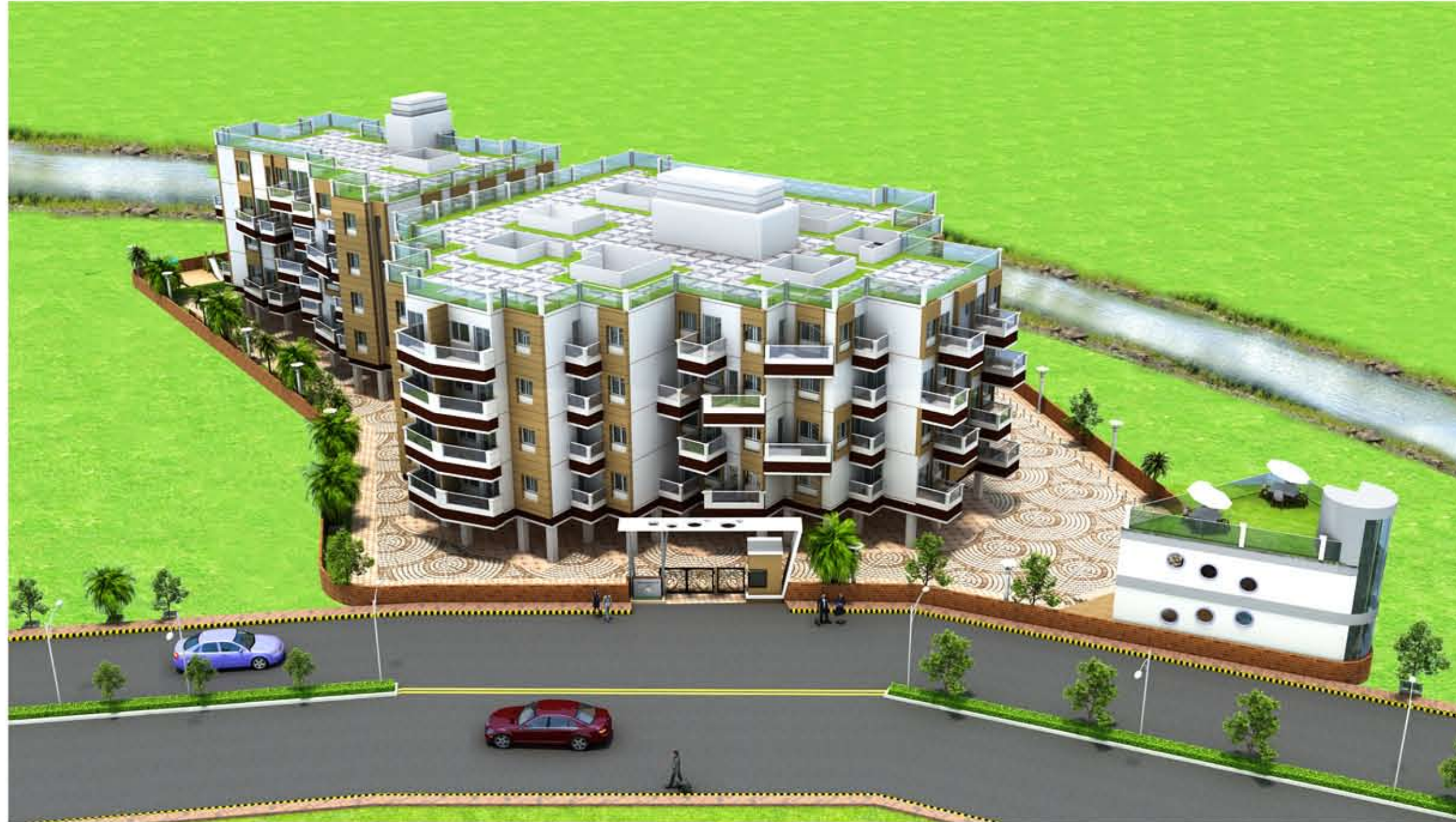
Luxury wonderfully wrapped in Refreshing Nature