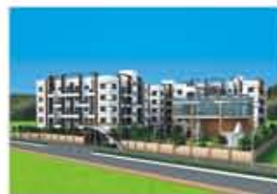
Village Residency 3 S.No. 98/1/4, Village Kasarsai, Marunji Road, Tal: Mulshi, Pune.