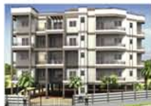
Village Residency 1 Gat. No. 2, Chandkhed, Marunje Road, Hinjewadi, Pune.