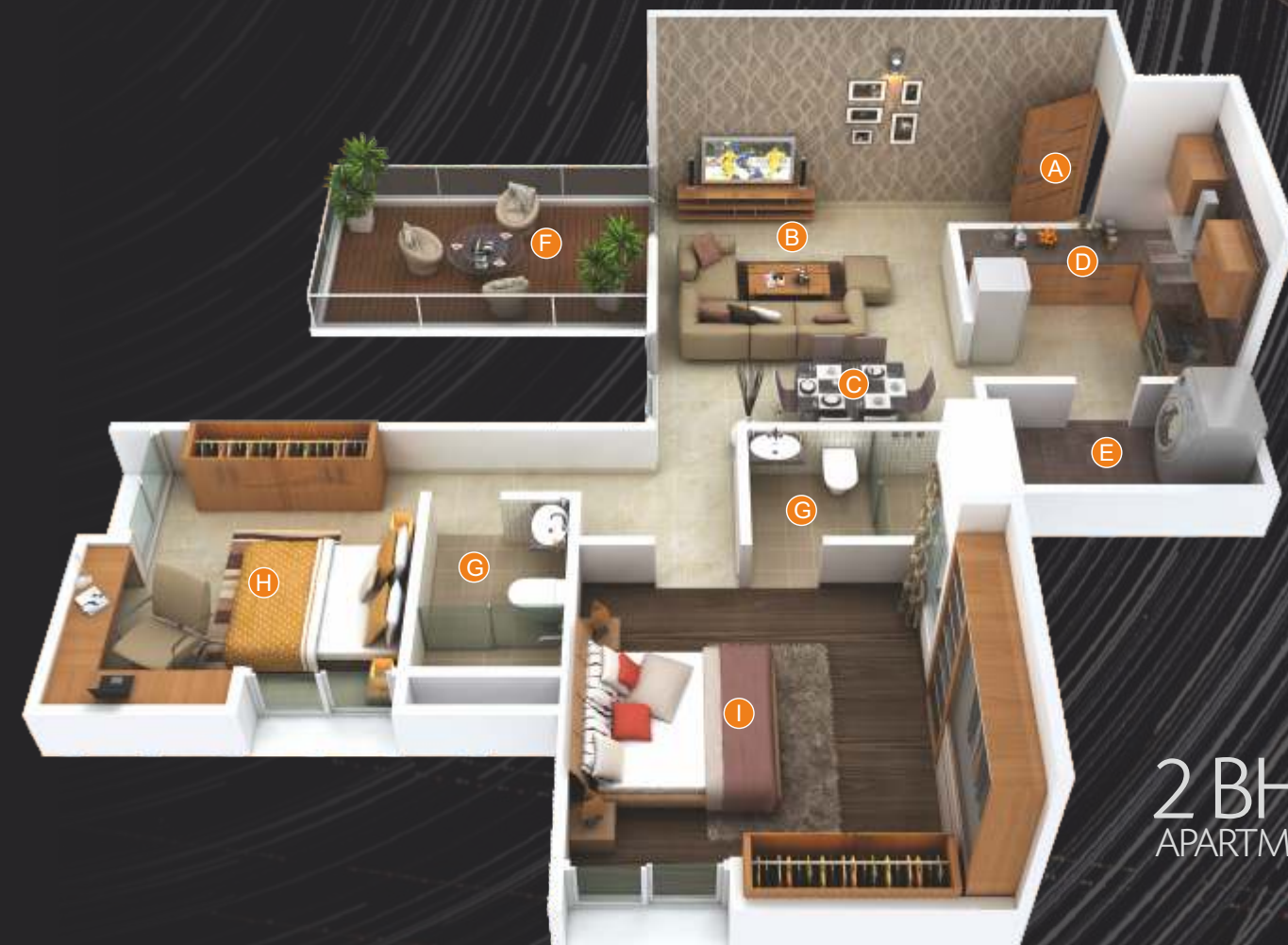
2 BHK APARTMENT