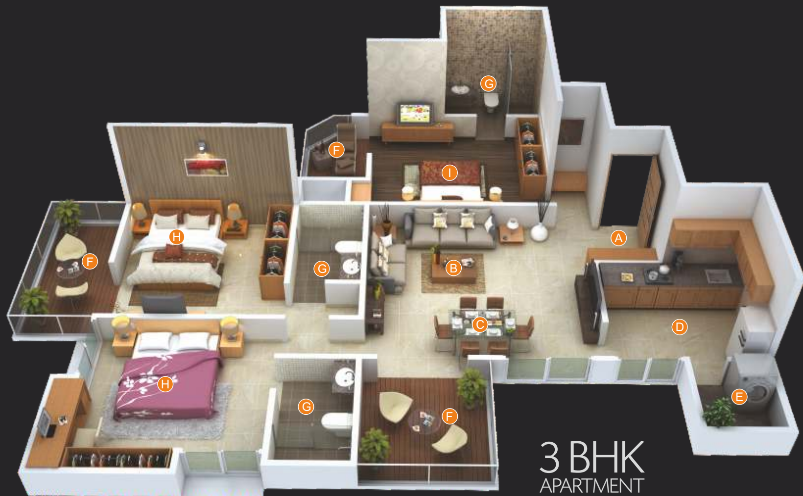
3 BHK APARTMENT