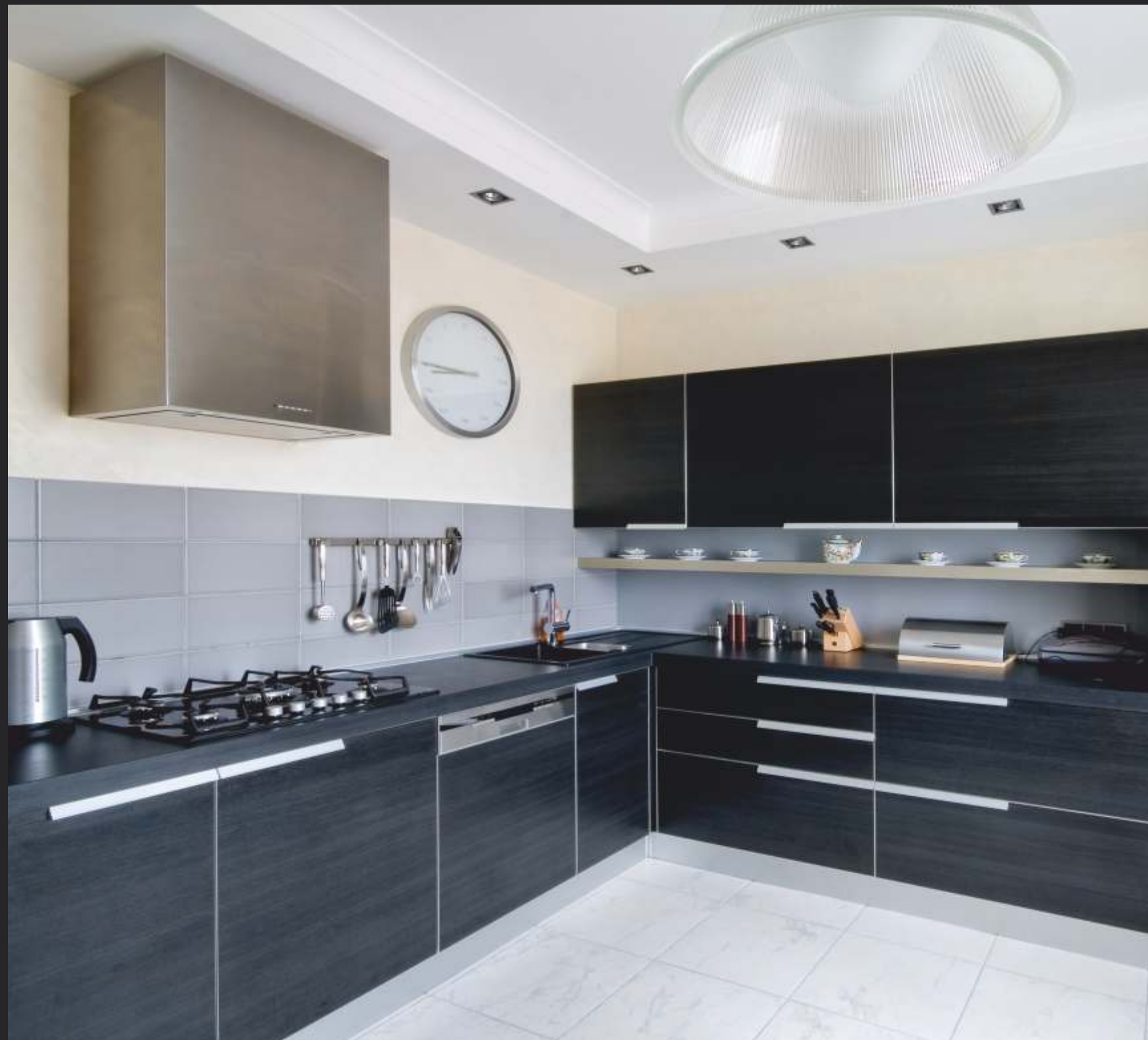
GRANITE 'L' SHAPED PLATFORM