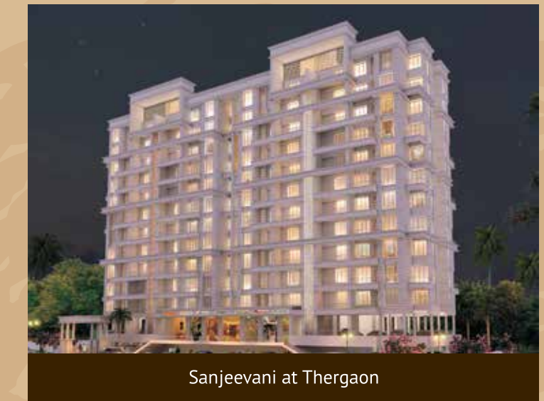
Sanjeevani at Thergaon