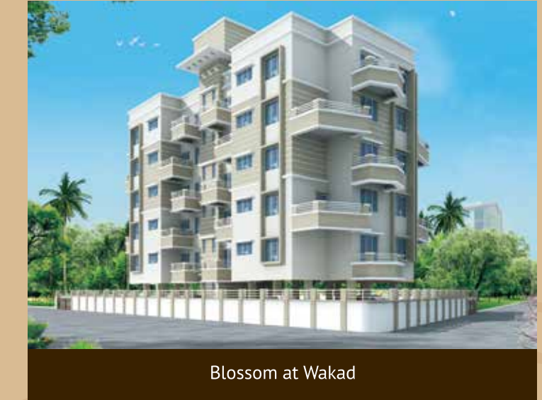
Blossom at Wakad