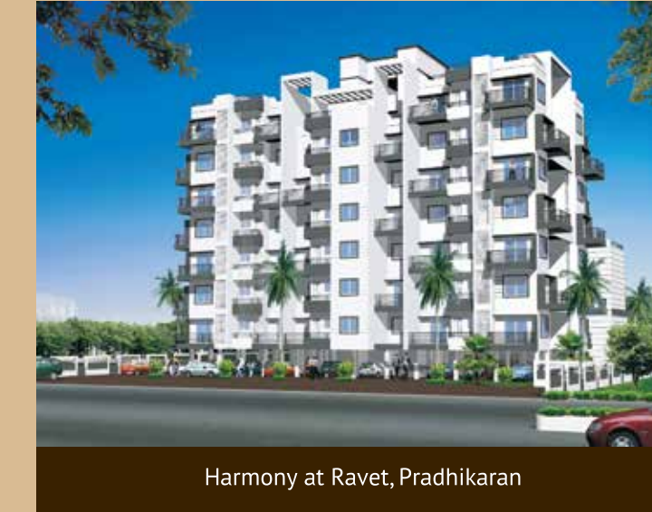
Harmony at Ravet, Pradhikaran