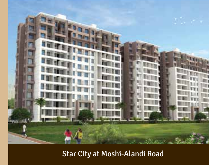
Star City at Moshi-Alandi Road