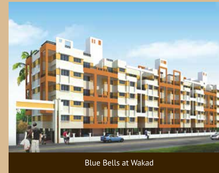
Blue Bells at Wakad