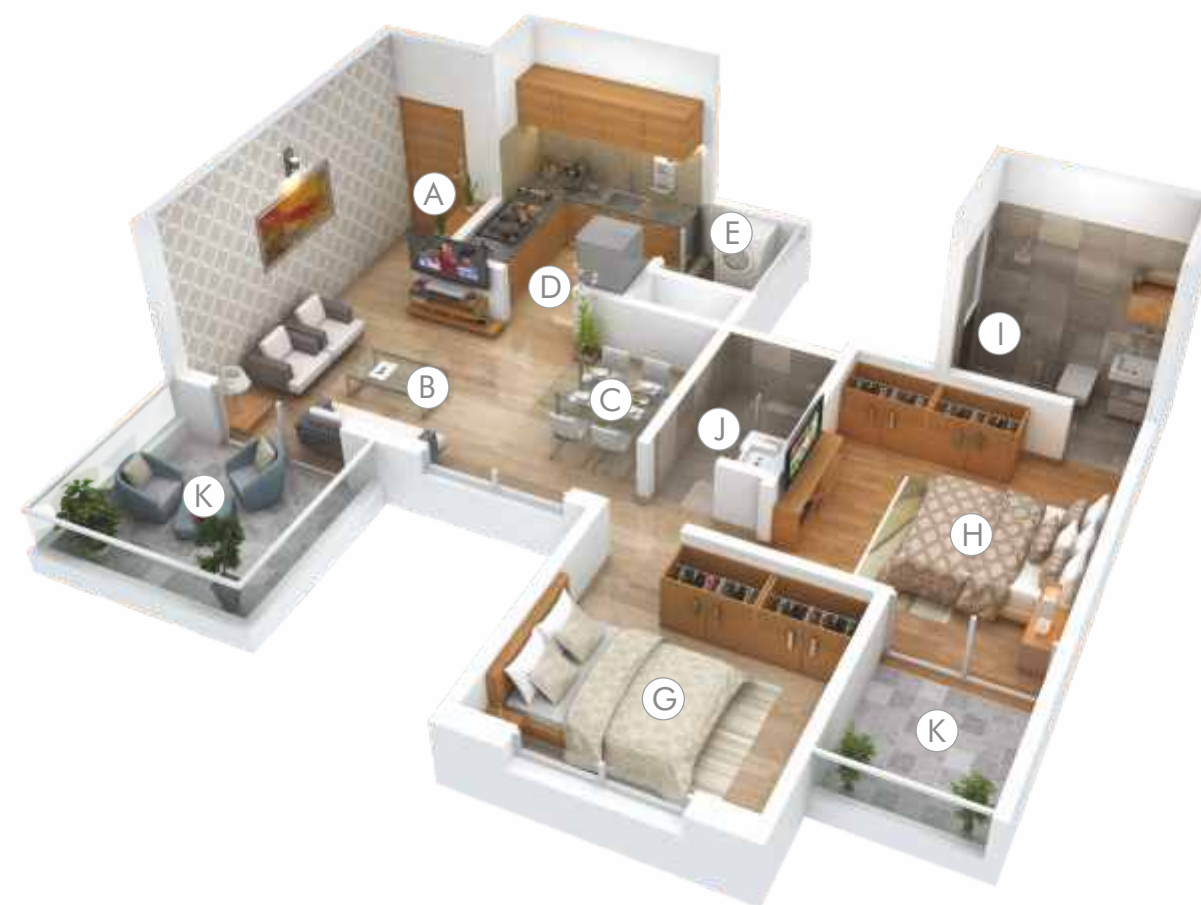
2 BHK Apartment