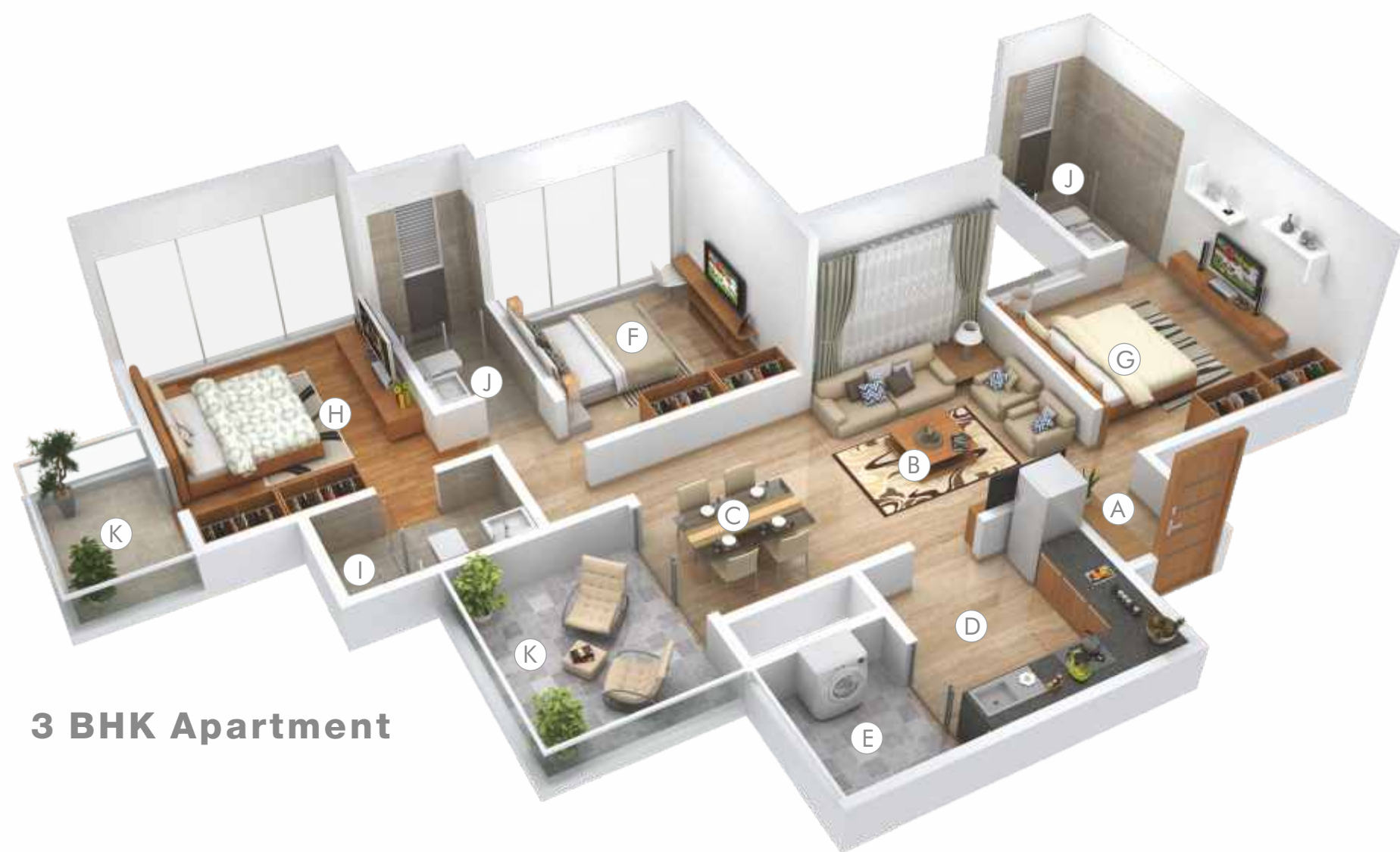
3 BHK Apartment