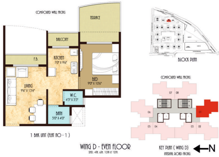
1 BHK Plan (650 sq.ft)