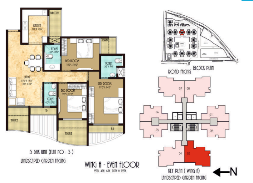
3 BHK Platinum Plan (1470 sq.ft)