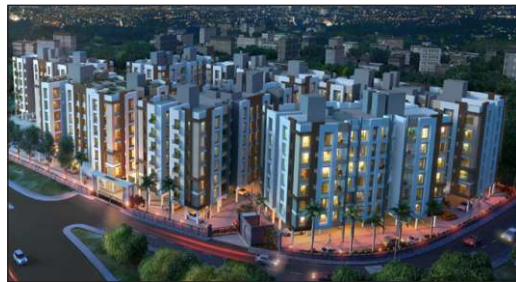
Freshia, Rajarhat, Kolkata