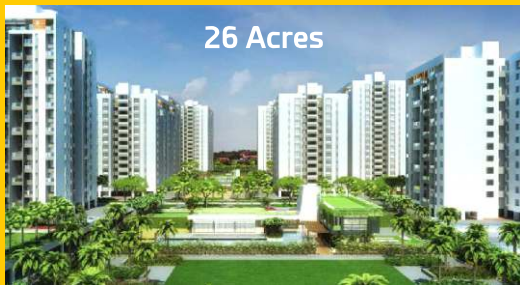
Little Earth, Kiwale, Pune