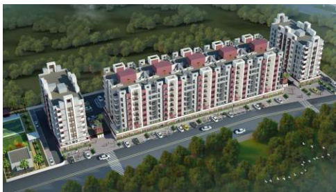
Silverwoods, Jalgaon Road, Aurangabad