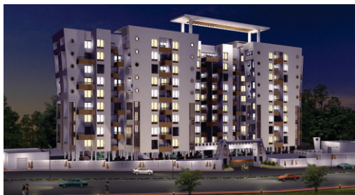
Athena, Kalyani Nagar, Pune