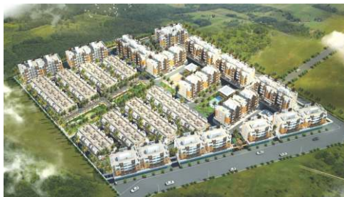
Kunjaban, Walunj, Aurangabad