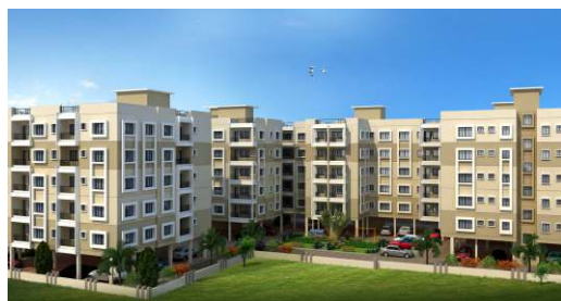
Green Island, Rajarhat, Kolkata