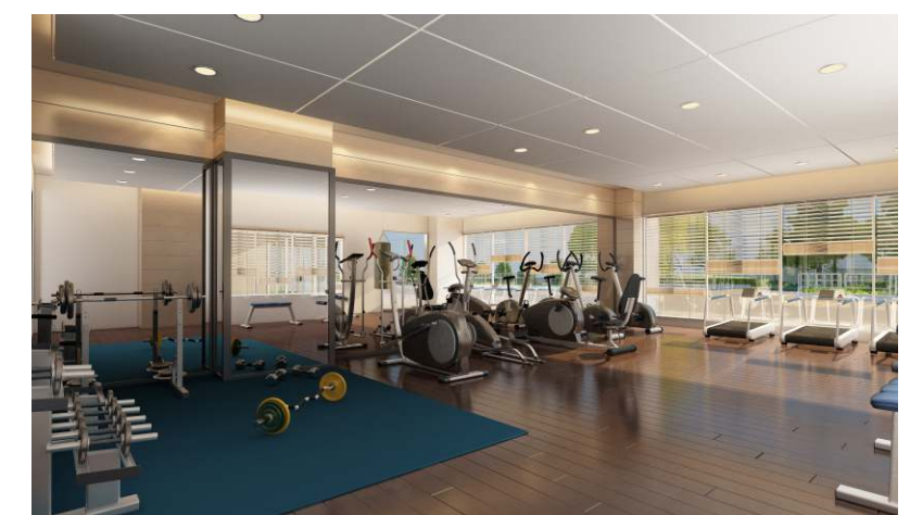
Well Equipped Gym