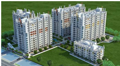
Green Heights, Raigachi, Kolkata