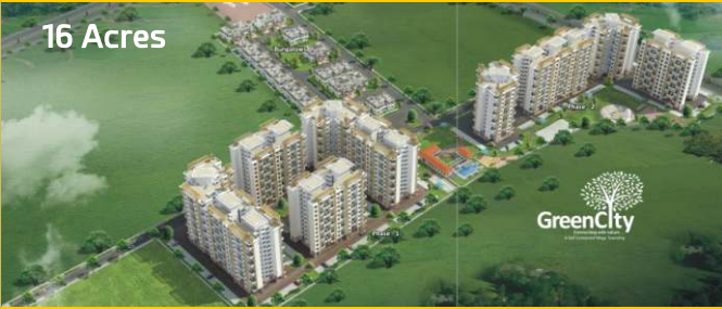
Green City, Hadapsar, Pune