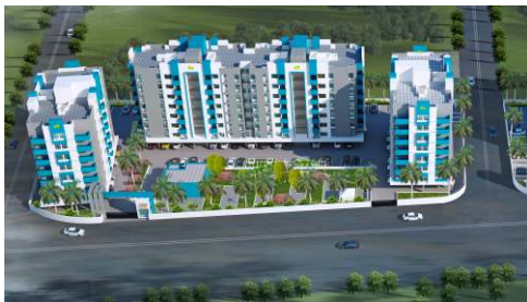
Chaitran, Paithan Road, Aurangabad.