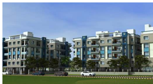
Green Leaf, Sahapara, Kolkata