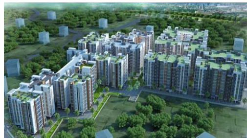
Urban Greens, Athghara, Kolkata