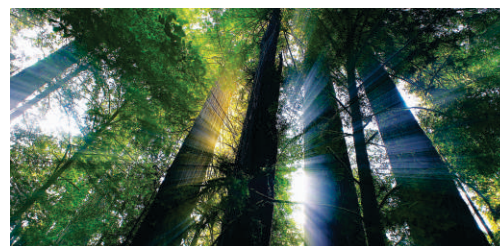
Taller Living, Higher Aspirations