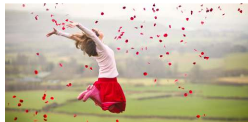
Away From The Crowd