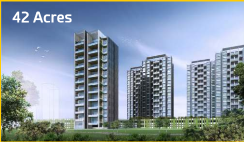
Rain Forest, Mamurdi, Pune