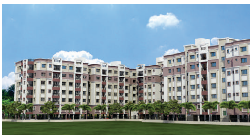
Green Oasis, Kaikhali, Kolkata