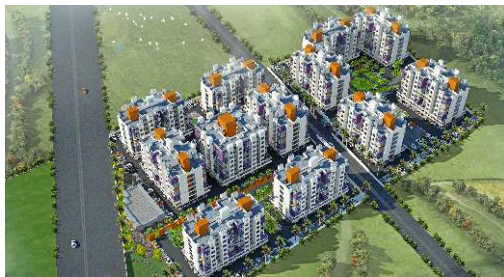
Neo City, Mitmita, Aurangabad