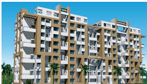
Silver Moon, Baner, Pune