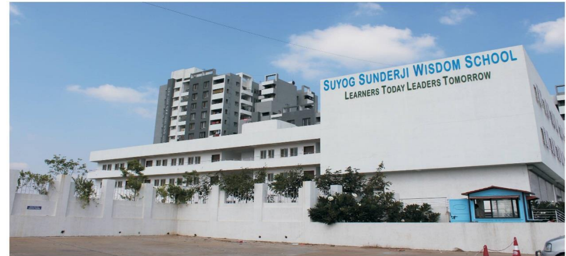
SCHOOL (CBSE PATTERN)