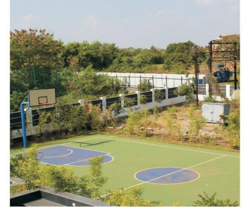
OUT DOOR GAMES