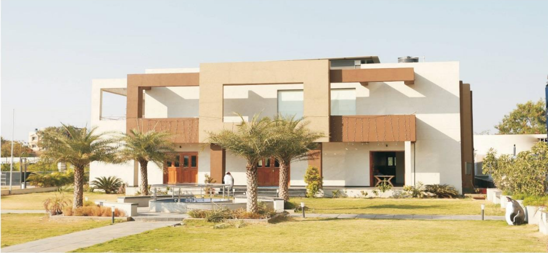
HUGE CLUB HOUSE