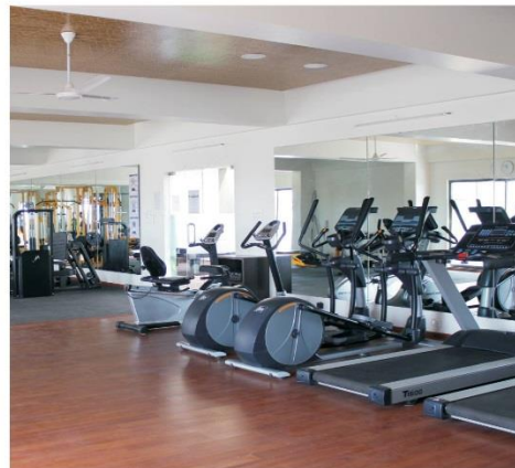
SPACIOUS & WELL EQUIPPED GYM