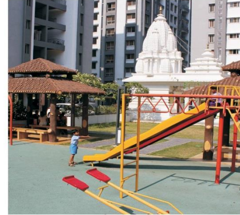
TEMPLE & CHILDREN'S PLAY AREA