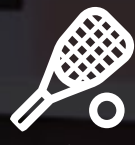
Indoor Squash Court