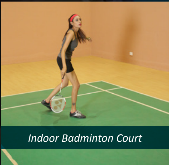
Indoor Badminton Court