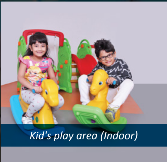
Kid's play area (Indoor)