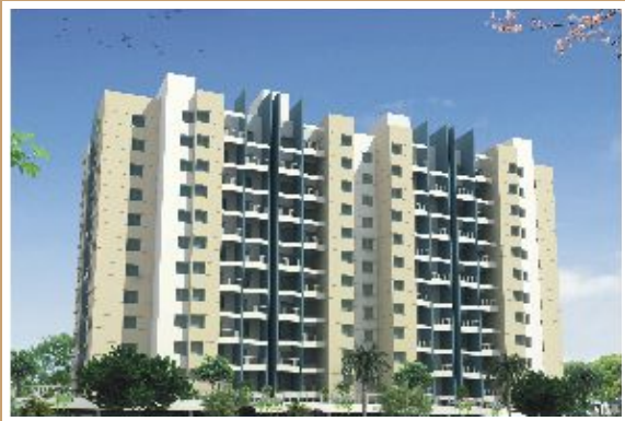
CASA IMPERIA - WAKAD