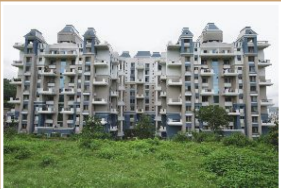
LA VALLE CASA - CHANDANI CHOWK - BAVDHAN