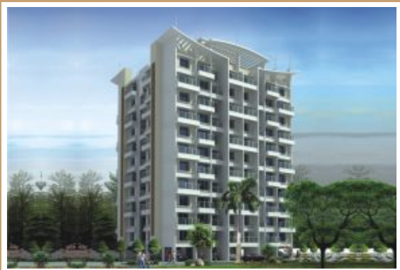
COSMOS - BANER