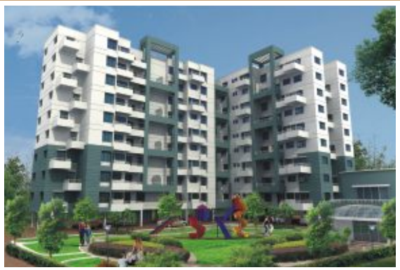
AMBER CLASSIC - AMBEGAON