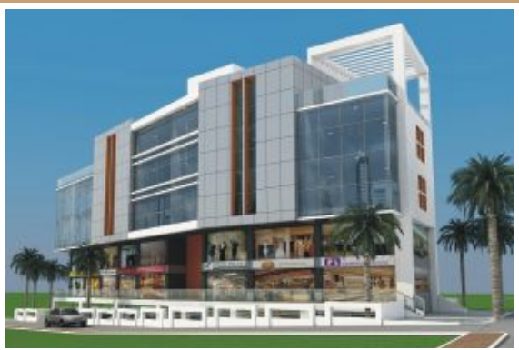
THE MINT - BANER