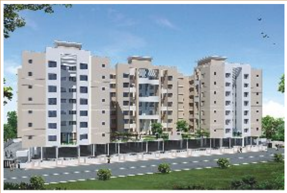
CASAPOLI - WAKAD