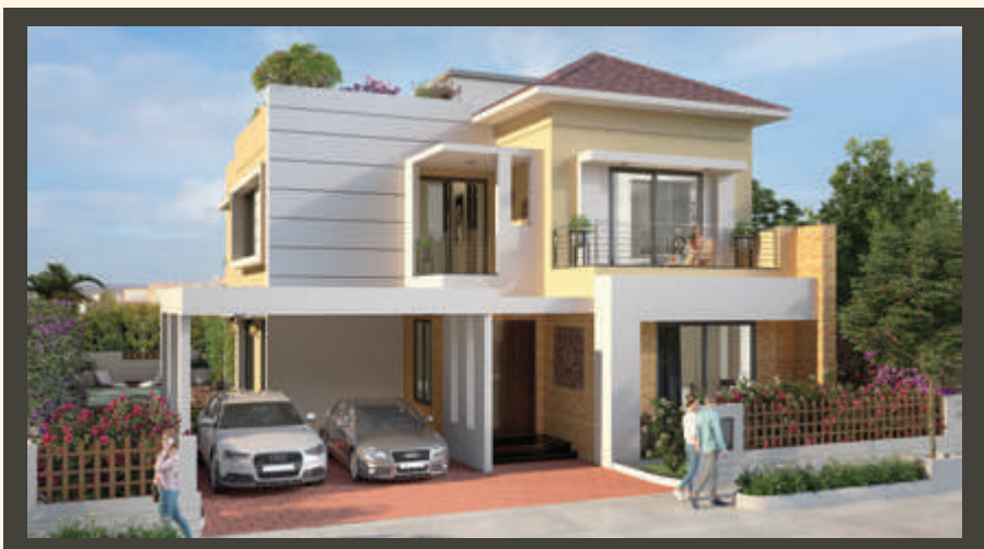
PRIDE CROSSWINDS VILLA