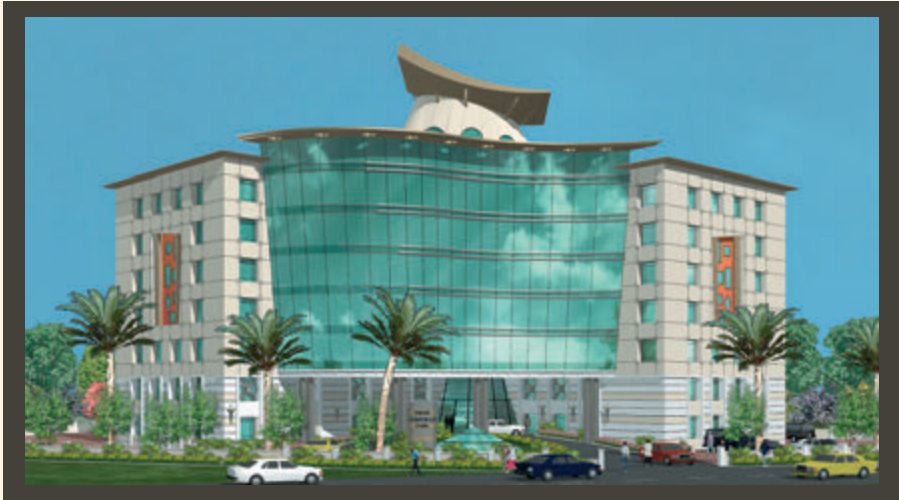
PRIME CORPORATE PARK