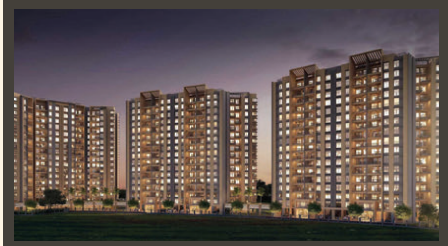
KINGSBURY PHASE I & II