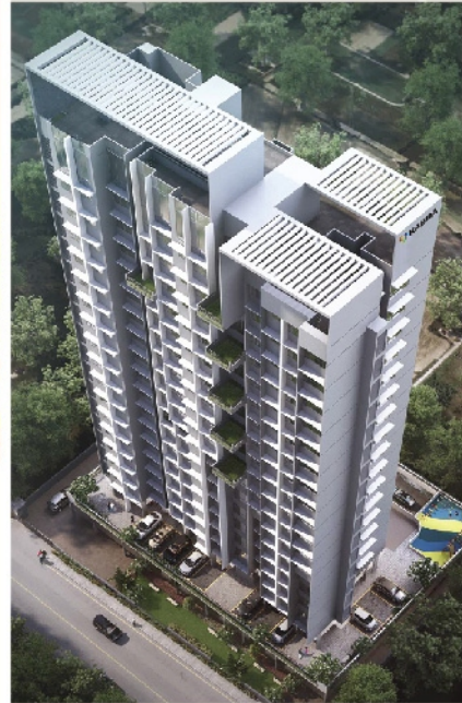
Ajitnath Malad (W)