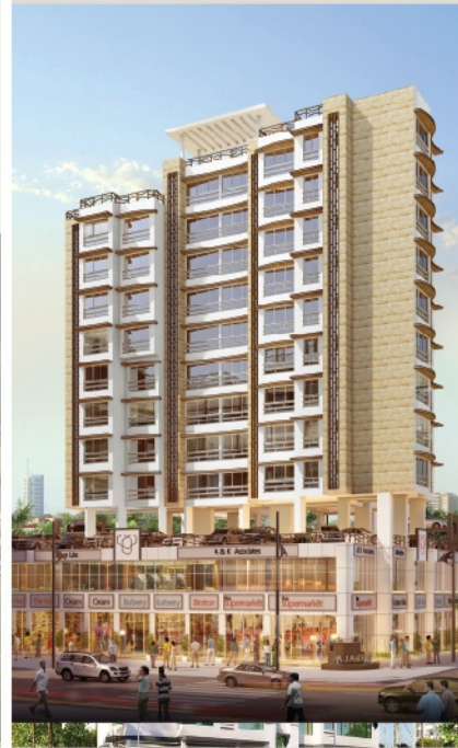
Ajanta Santacruz (W)