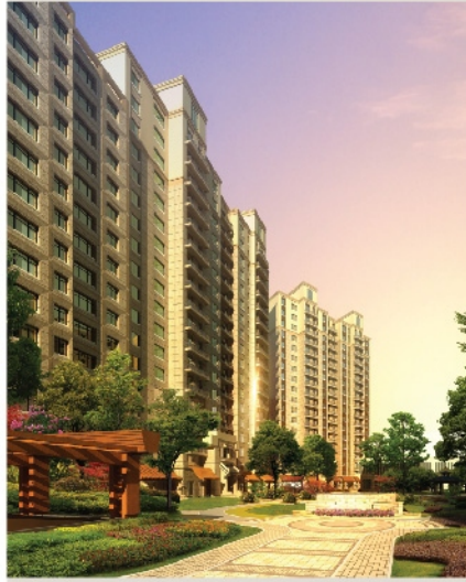
GOP Santacruz (E)