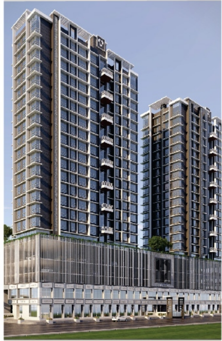
Pratap Andheri (W)