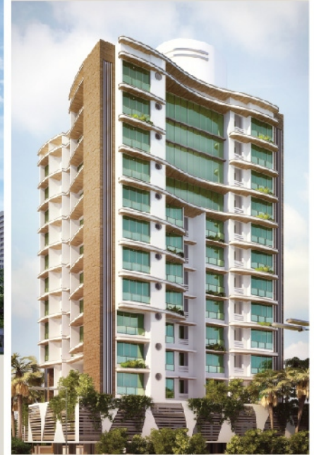
Jeevansaathi Andheri (W)