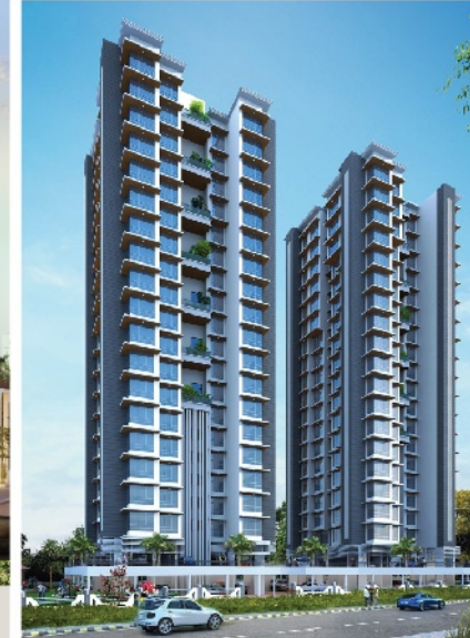
Shantikishan Dahisar (E)