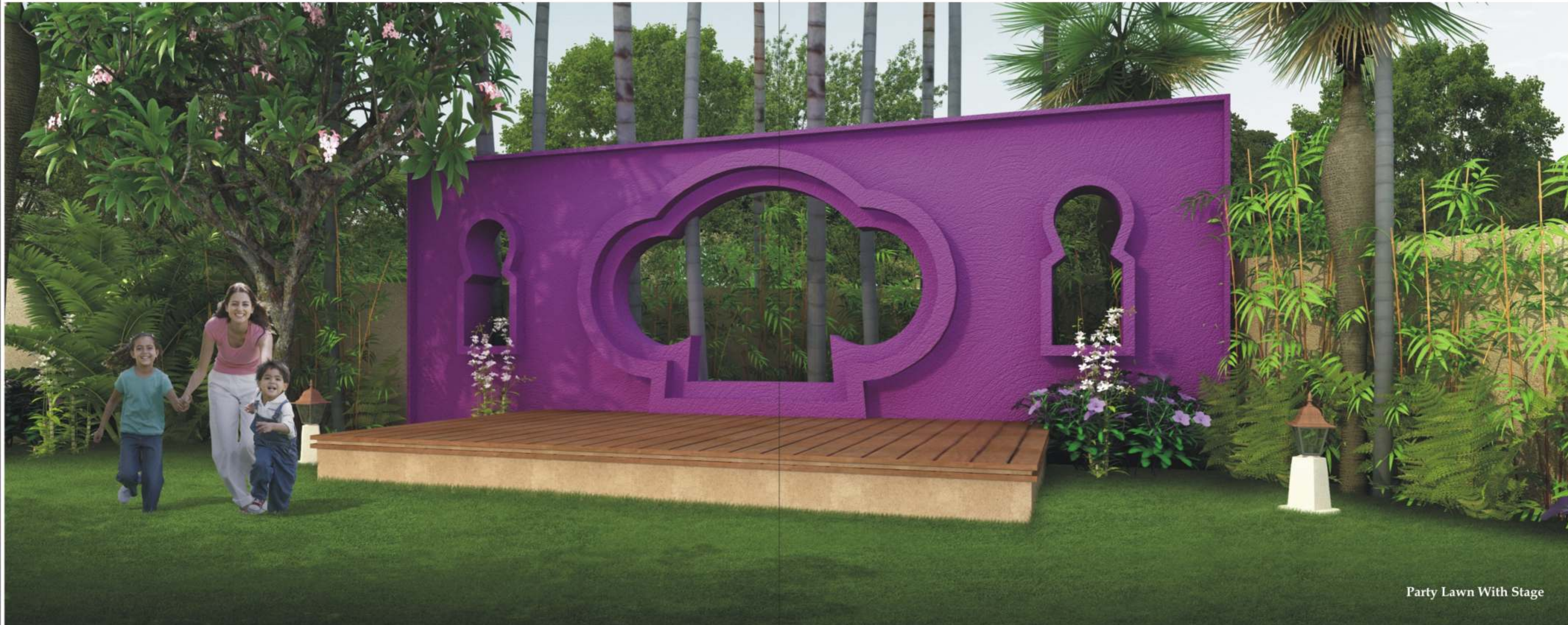
Party Lawn With Stage