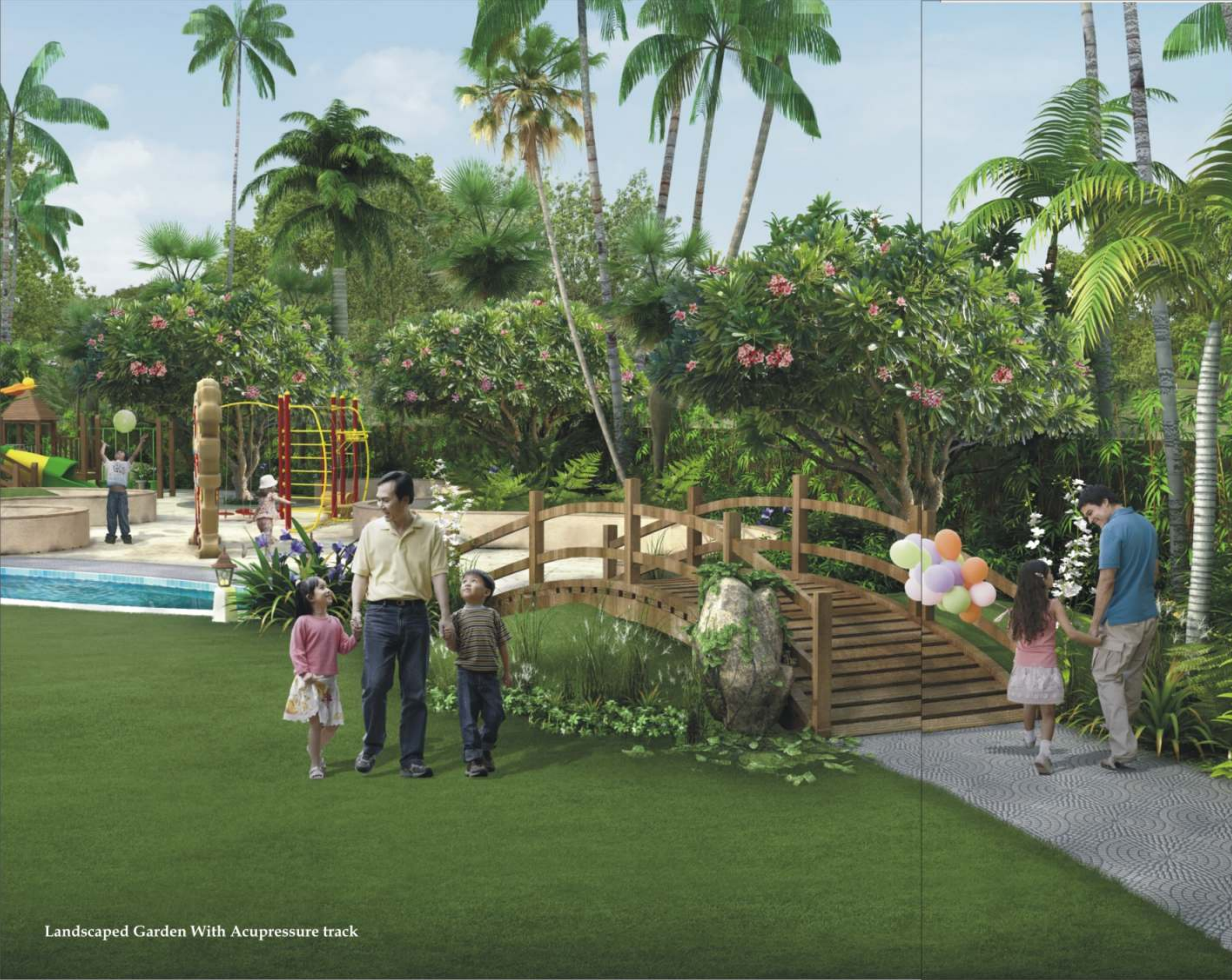
Landscaped Garden With Acupressure track