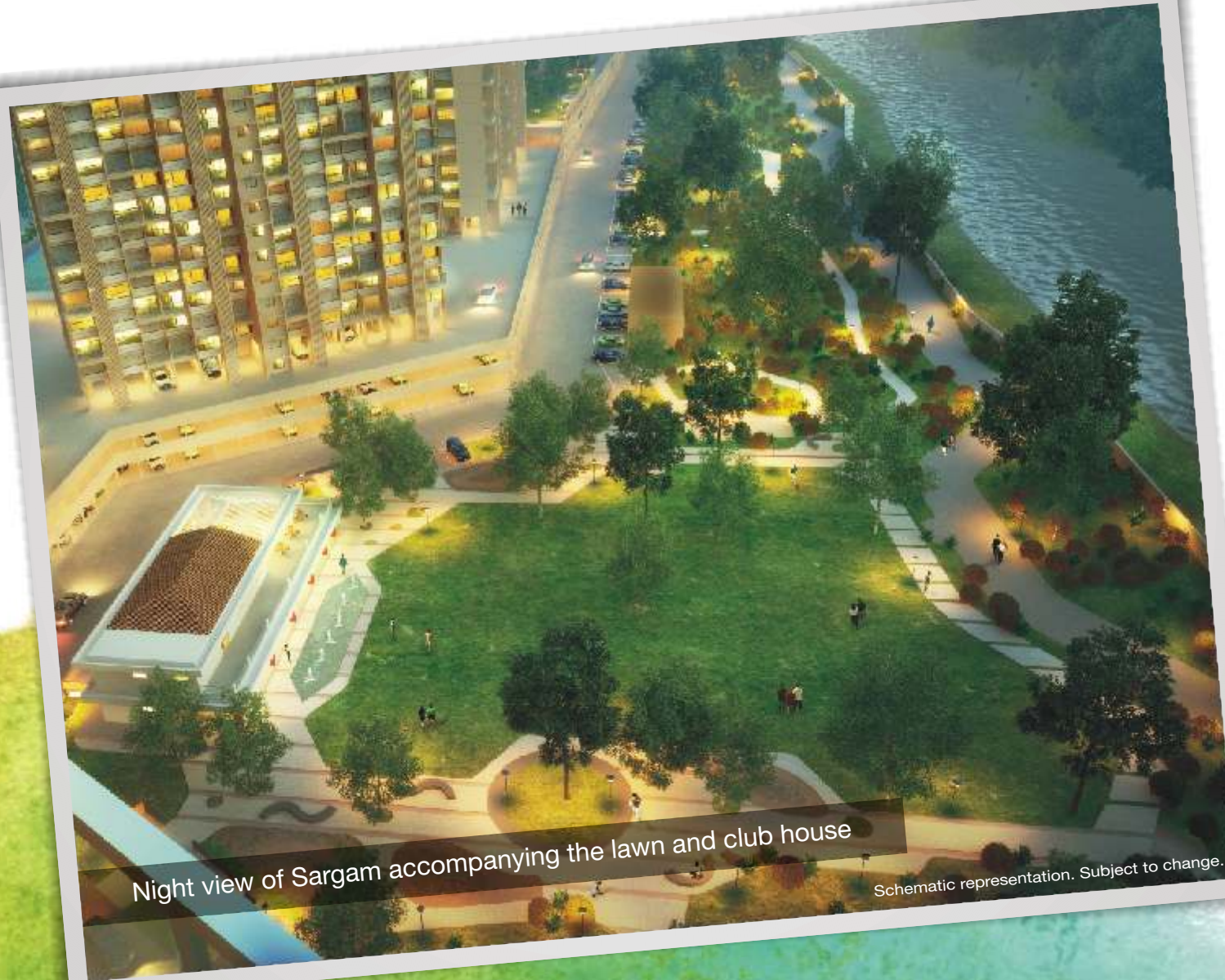
Night view of Sargam accompanying the lawn and club house

Schematic representation. Subject to change.