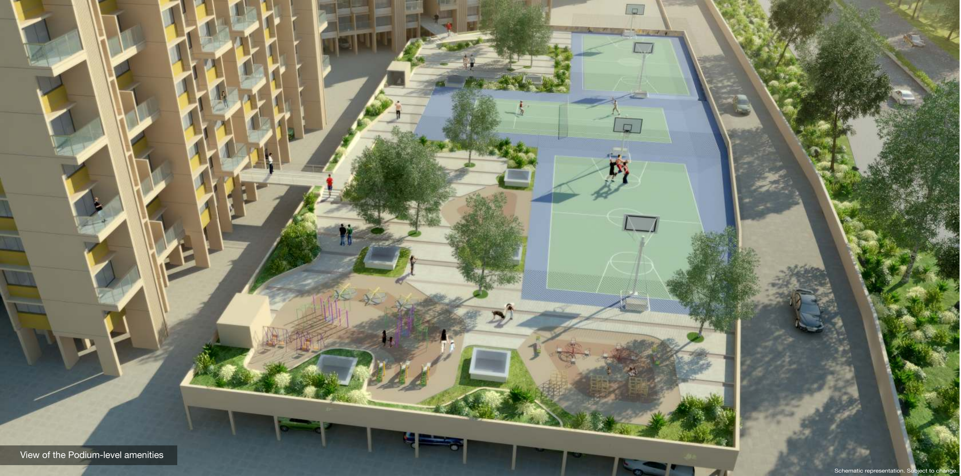
View of the Podium-level amenities

Schematic representation. Subject to change.