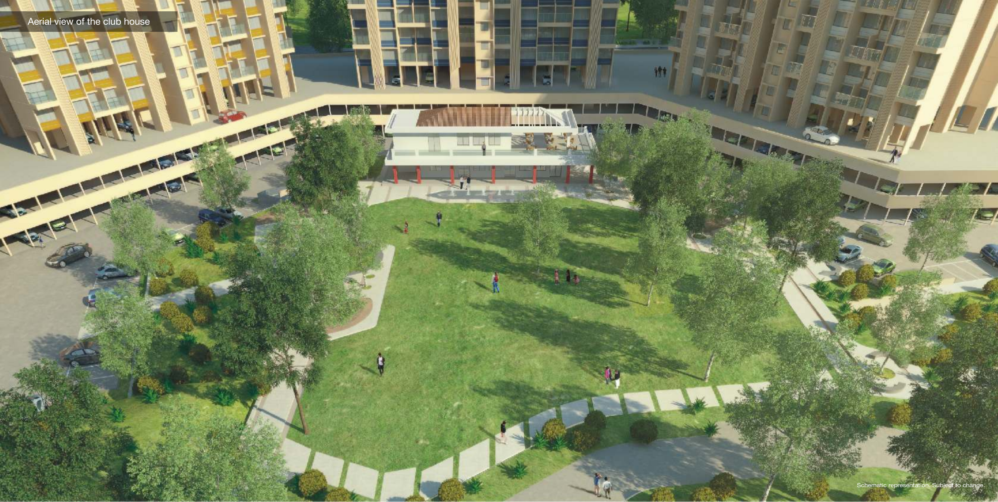
Aerial view of the club house