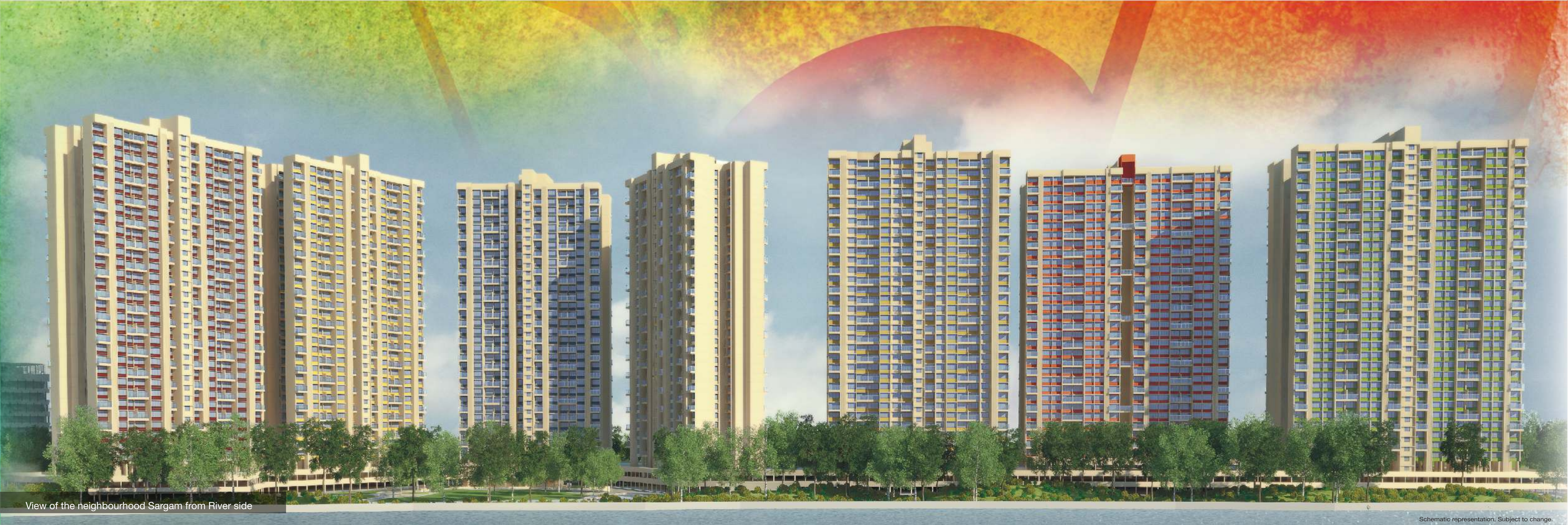
View of the neighbourhood Sargam from River side